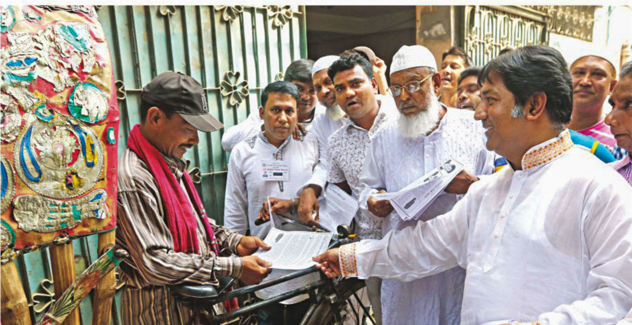
Mayor aspirant Saifuddin Ahmed Milon of Dhaka South City Corporation asks for votes in Lalbagh area yesterday.