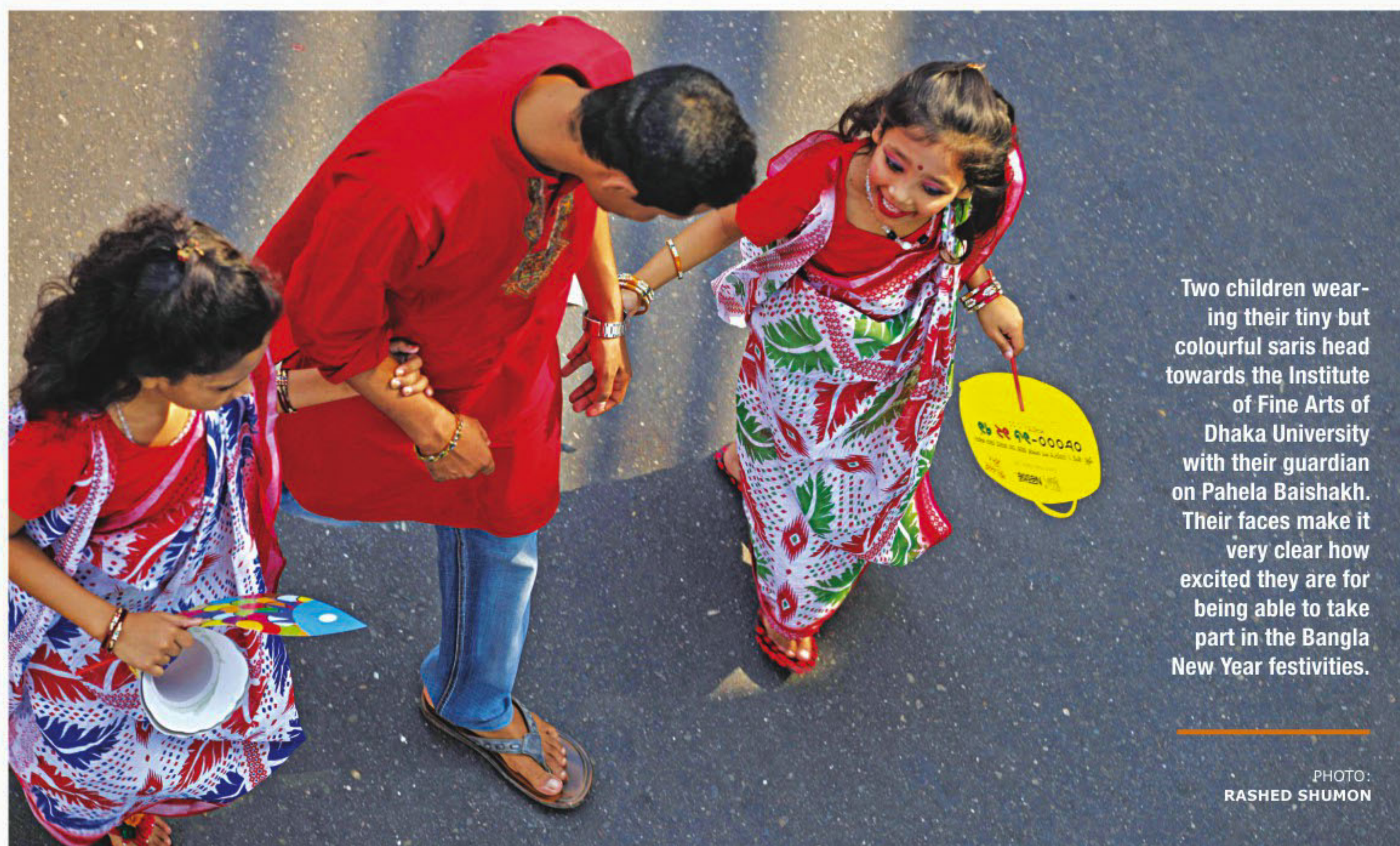
Two children wearing their tiny but colourful saris head towards the Institute of Fine Arts of Dhaka University with their guardian on Pahela Baishakh. Their faces make it very clear how excited they are for being able to take part in the Bangla New Year festivities.