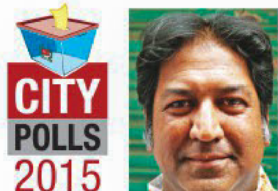
PLEDGES & PRIORITIES

"If I am elected mayor, I will share my ideas and experience with the city planners and architects to give this city a complete facelift of world standard.