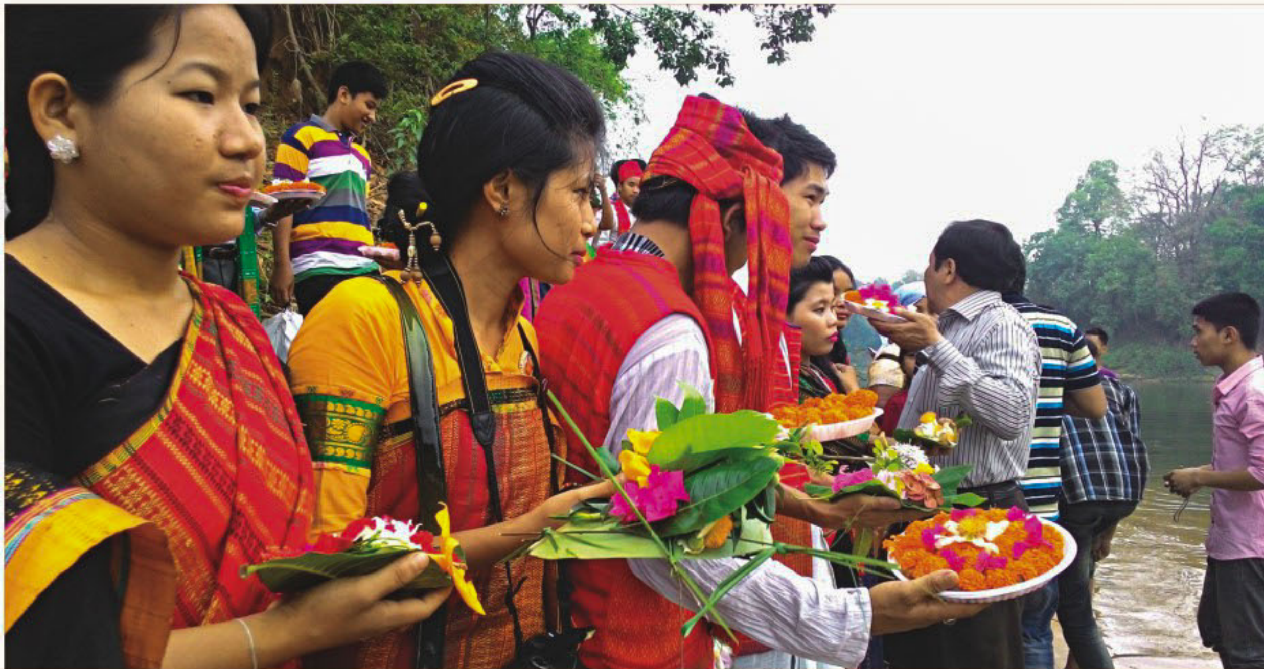
Indigenous people of Rangamati wait to float flowers in the Kaptai Lake yesterday morning -- a ritual to worship the god of water and pray for a life as beautiful as flowers -- beginning the local festival to welcome the New Year.