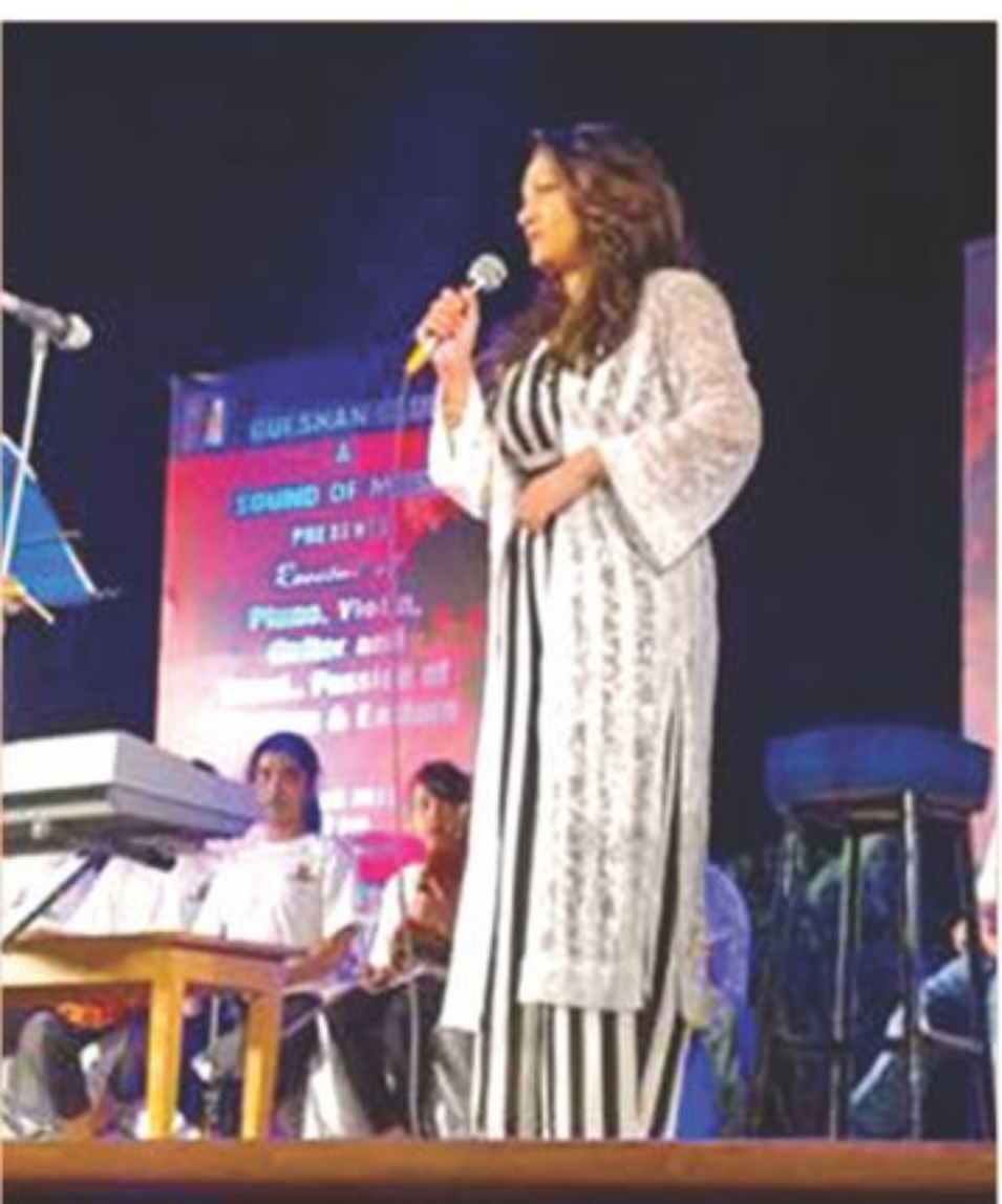
A singer performs at a musical event hosted by musical school Sound of Music, held recently at the capital's Gulshan Club. A number of teachers and students of the school performed at the recital, to a vibrant audience.