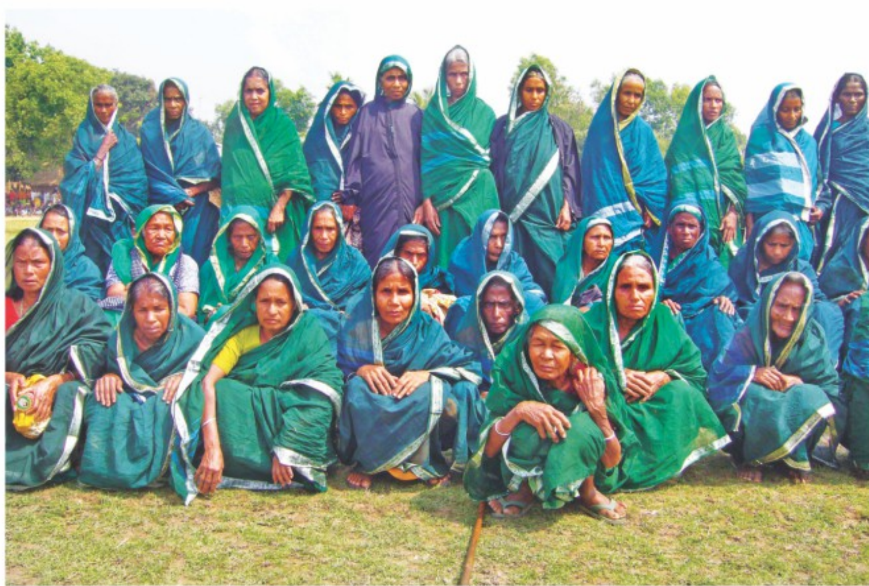
The widows of what is now known as Bidhoba Palli (Village of widows) in Nalitabari upazila of Sherpur. Kamaruzzaman planned and took part in the killing of at least 164 people of the village on July 25, 1971. The photo was taken in May 2013.

SHAHEEN MOLLAH and RAFIUL ISLAM Nazimuddin Road, the main street leading to the Dhaka Central Jail started cramming with policemen, journalists and onlookers since last afternoon. A little after 6:00pm, the road and its adjoining alleys were made off-limits to people except journalists and the locals. Some shops in neighbouring areas were also closed down. The whole place was teeming with security personnel aligned in three rows. Some of them stood guard on the rooftops of the nearby buildings. Newsmen began giving live updates from the spot around the sundown. A few SEE PAGE 2 COL 1 PADDY FIELD CLEARED FOR BURIAL -- PAGE 2