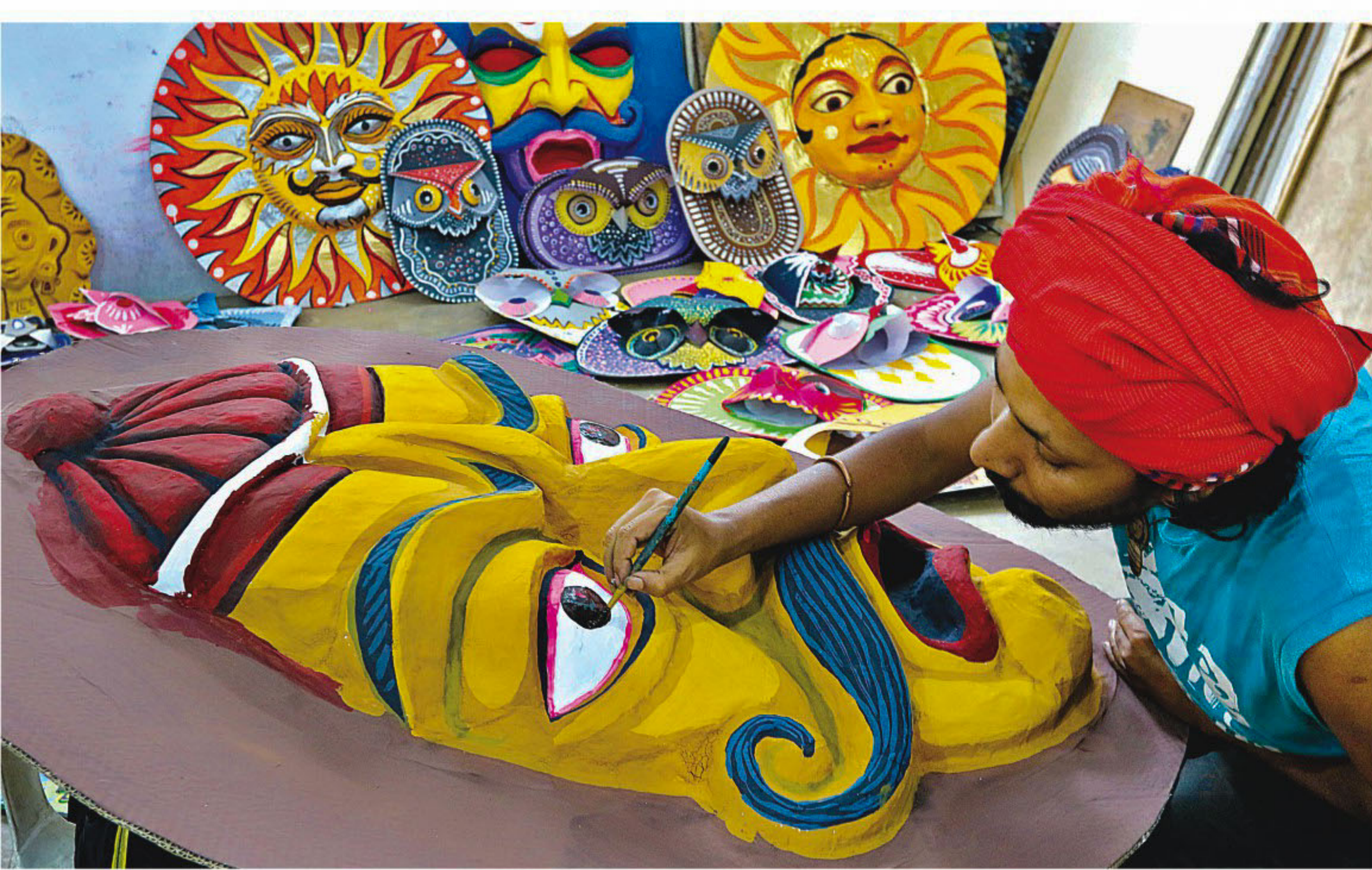
Finishing touches are being given to masks at the Institute of Fine Arts of Dhaka University yesterday. The masks are for Mangal Shobhajatra, a colourful procession that is a staple of the Pehela Baishakh celebrations.

BBC ONLINE Plucking hairs in a precise pattern can make even more pop up in their place, a US study suggests. Playing with the density of hair removed altered how serious an injury the body recognised and in turn how much hair regrew. The team managed to regenerate 1,300 hairs by plucking 200, in the study using mice reported in Cell journal. Experts said it was "a really nice science" but were uncertain if it could lead to a cure for human baldness. Half of men have male-pattern baldness by the age of 50. The team at the University of Southern SEE PAGE 11 COL 4