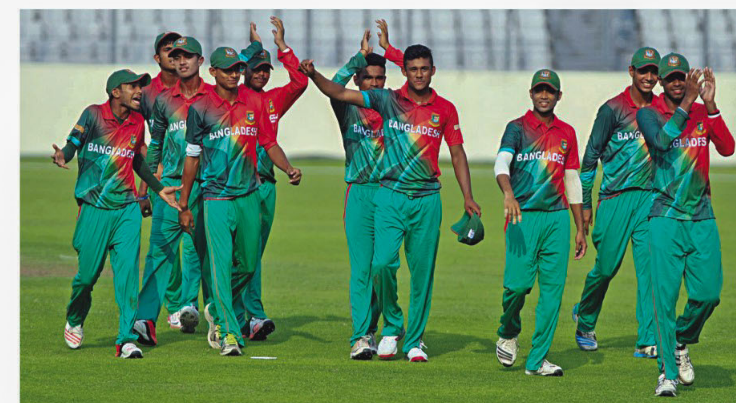
Bangladesh under-19 cricketers are ecstatic after handing their South African counterparts a massive 140-run defeat in Mirpur yesterday to take a 2-0 lead in the seven-match series. The teams will play the remaining youth ODIs in Cox's Bazar and Chittagong.

"We have seen such products (male contraceptives) being advertised on TV during matches, but we don't have guidelines that limit a franchise from getting one as a team sponsor," said Rajeev Shukla, the IPL governing council chairman.