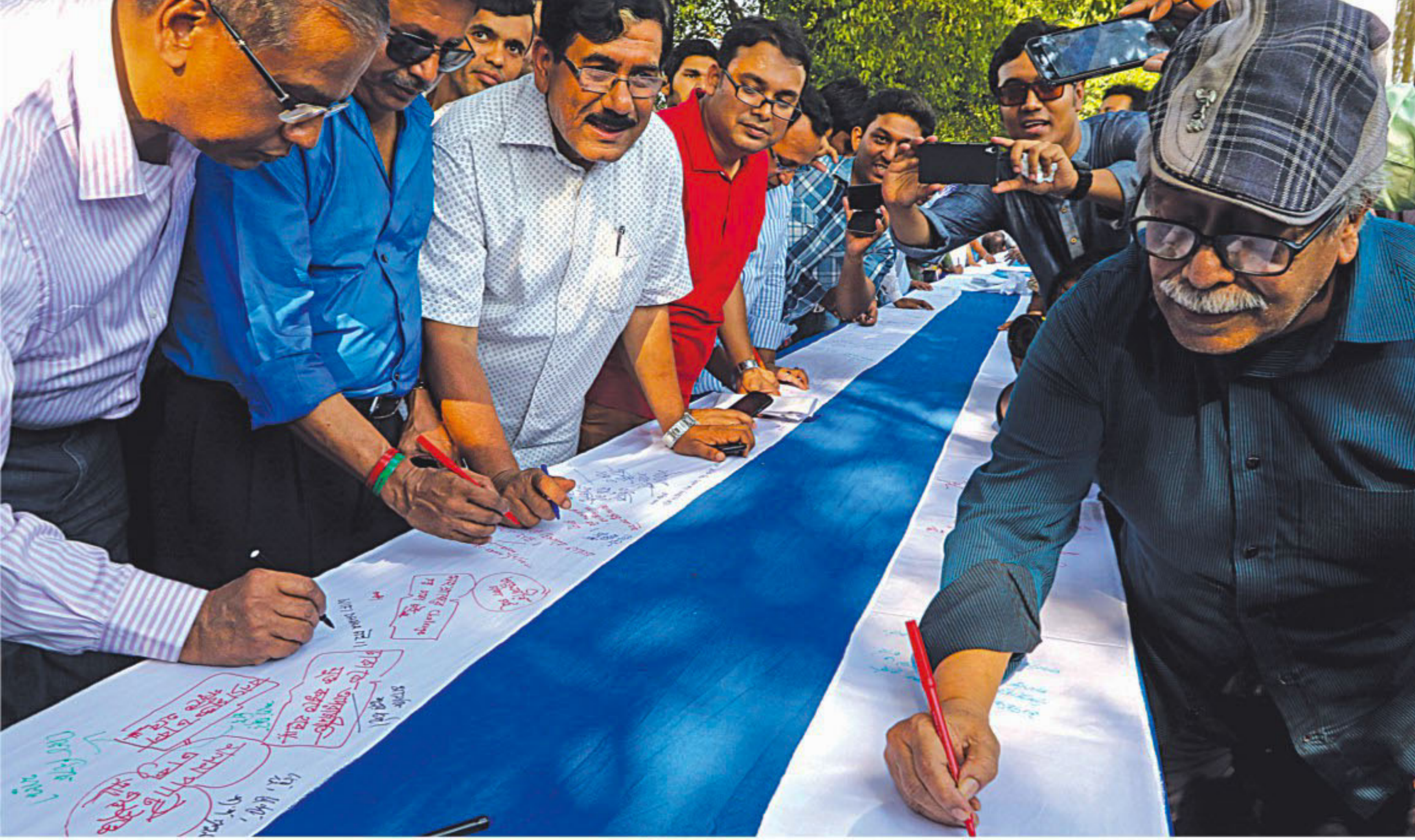
Dhaka city voters write down their expectations of and good wishes for Awami League-backed mayoral candidate Annisul Huq on a kilometre-long canvas at Manik Mia Avenue yesterday. Titled "Kemon Dhaka Chai", the programme was organised by Dhaka Nagorik Samaj, a platform of civil society members supporting the ruling party affiliated contenders.