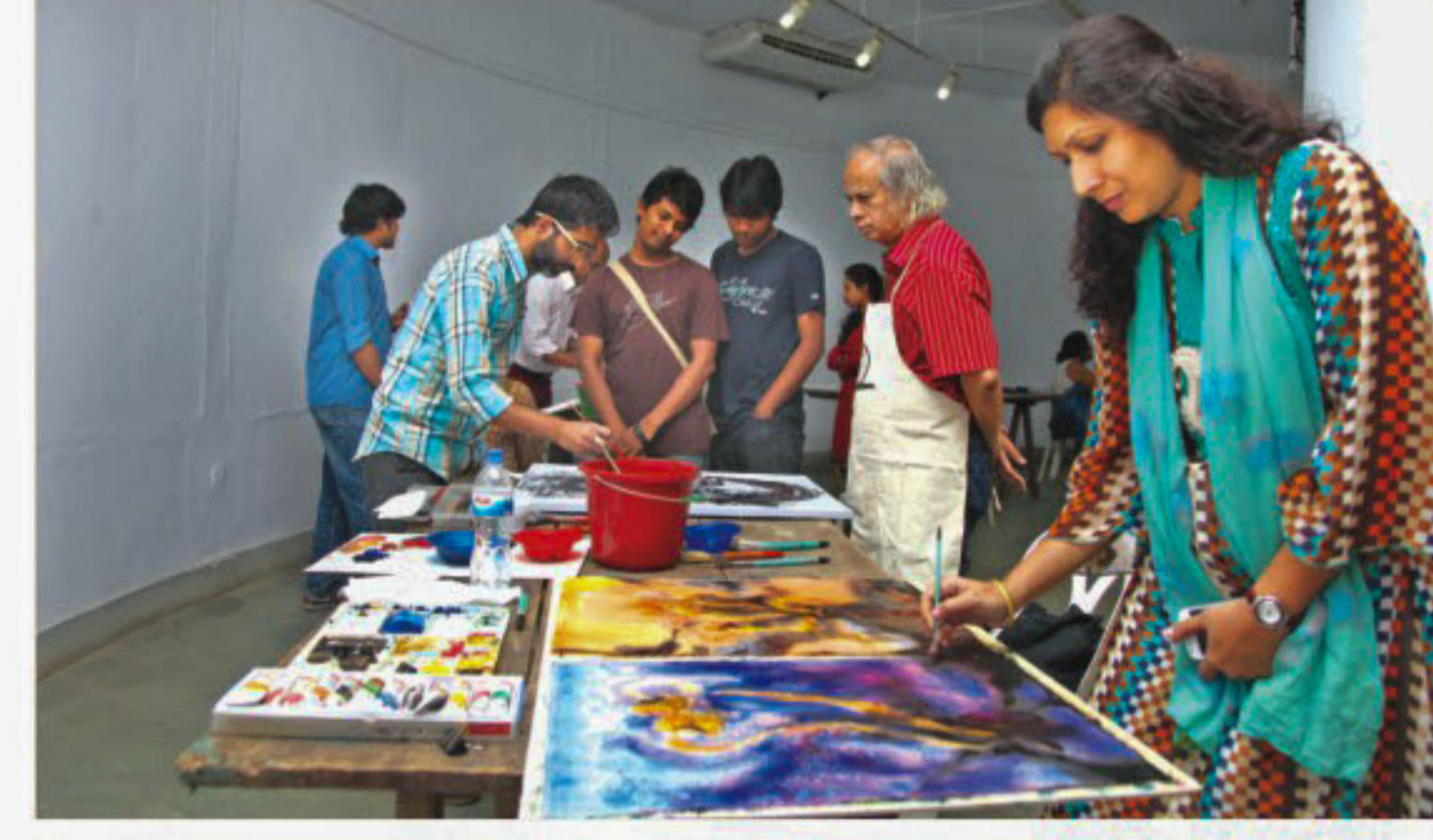
FFA teachers, students and renowned artists put finishing touches on paintings and other decorative pieces.

Boishakh. What draws one's attention are the huge bamboo frames which students are busy working on. They are working on replicas of a royal elephant delineating Jamini Roy's famous folk motif, a folk tiger, colourful birds, fish, a big tepa putul, goats, and a horse -- which will be among the main attractions. FFA students are raising funds for the Mongol Shobha Jatra through the sale of watercolour paintings, lokkishora, shokher