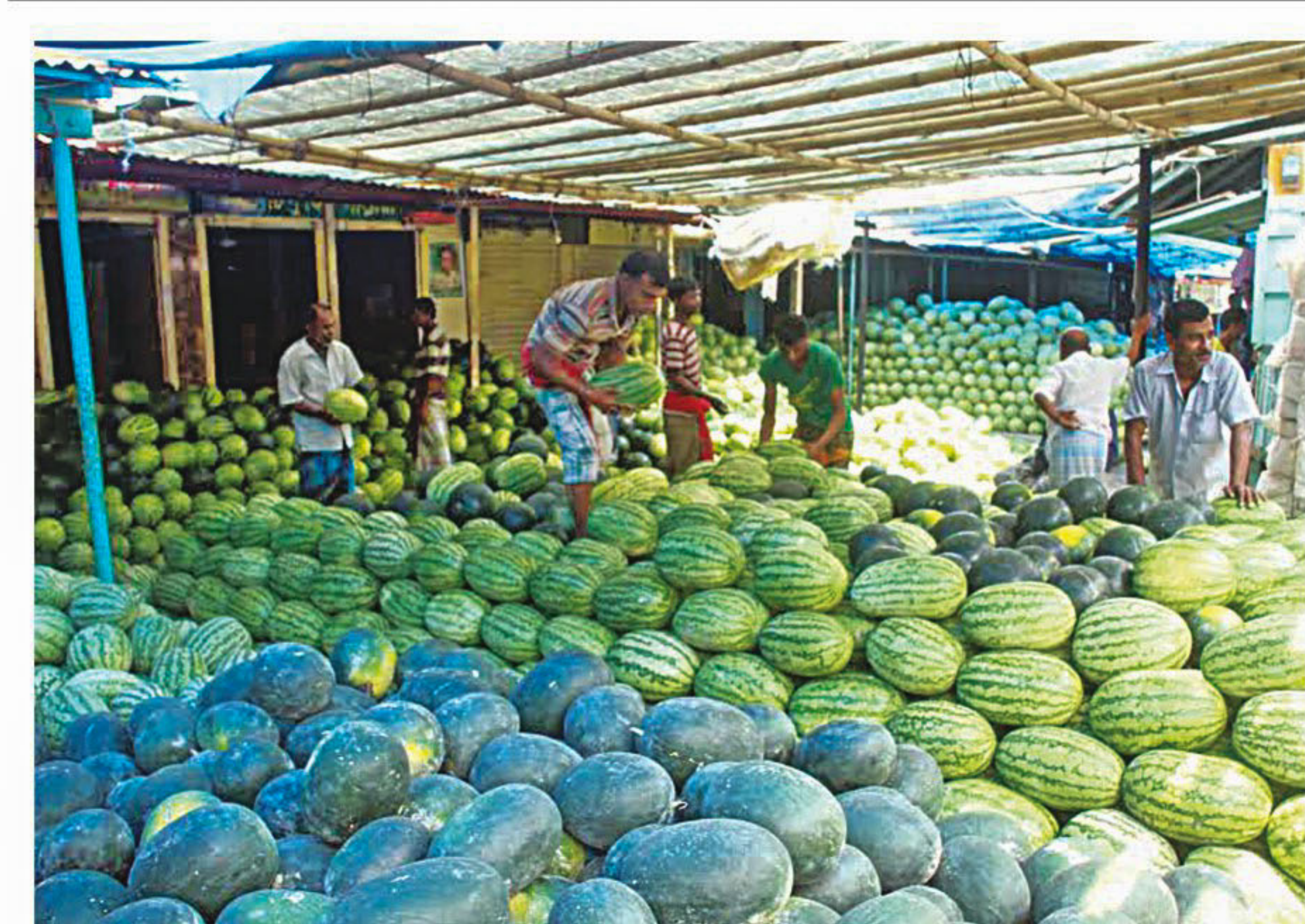
A shop in the Fishery Market in Barisal city overflowing with melons yesterday. As the name suggests, the market should be for fish but a ban on hilsa fishing has led to almost all the shopkeepers of the market to sell watermelons instead.