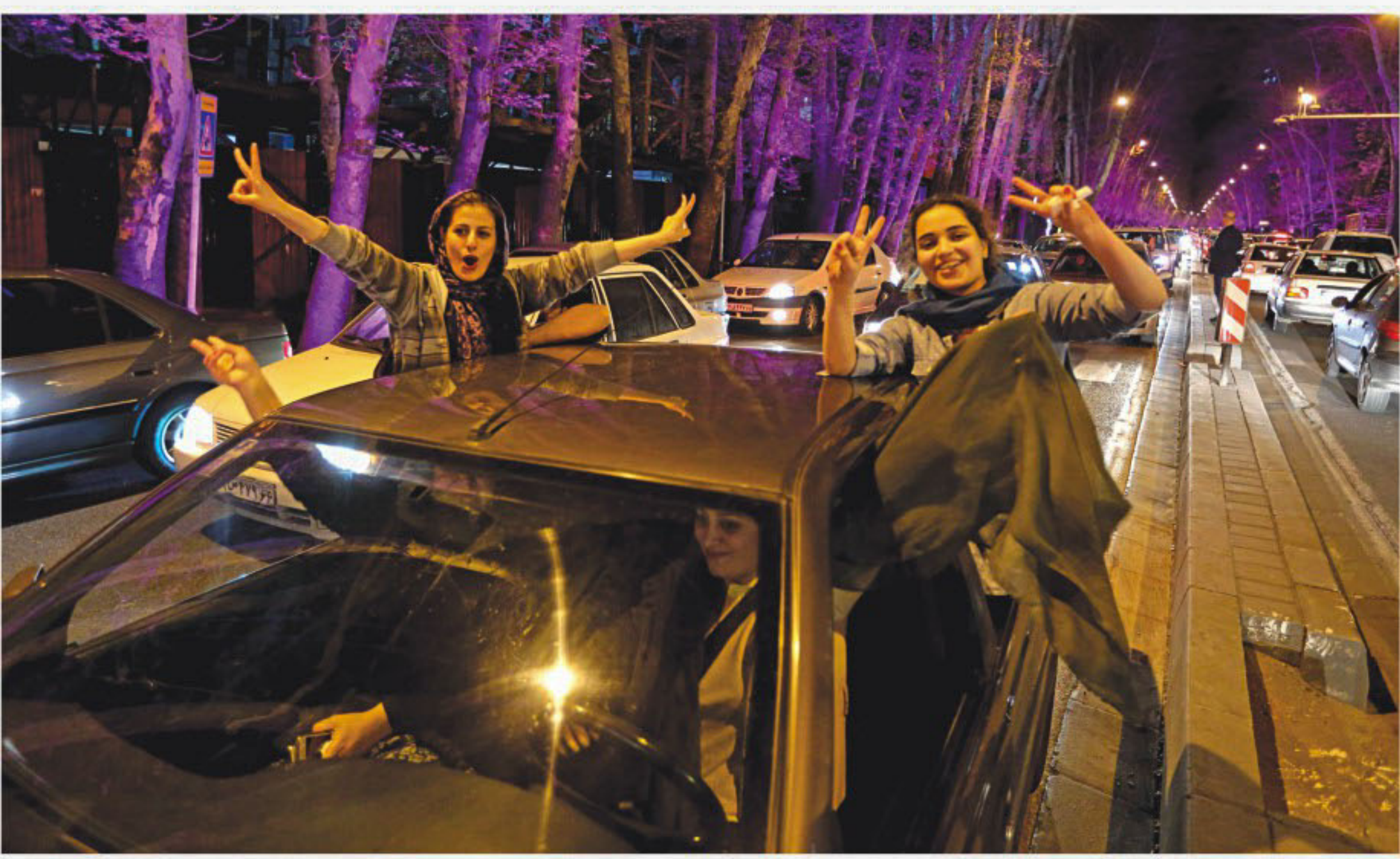
Women flash the "V for Victory" sign as they celebrate on Valiasr Street in northern Tehran on Thursday after the announcement of an agreement on Iran nuclear talks.

BNP sets up new platform for campaign STAFF CORRESPONDENT The BNP has formed a new platform comprising professionals from different sectors to boost support for the party-backed mayoral aspirants in the upcoming Dhaka city corporation polls. Formed under the directives of BNP Chairperson Khaleda Zia, the platform will be headed by former SEE PAGE 11 COL 5 MORE ON PAGE 16