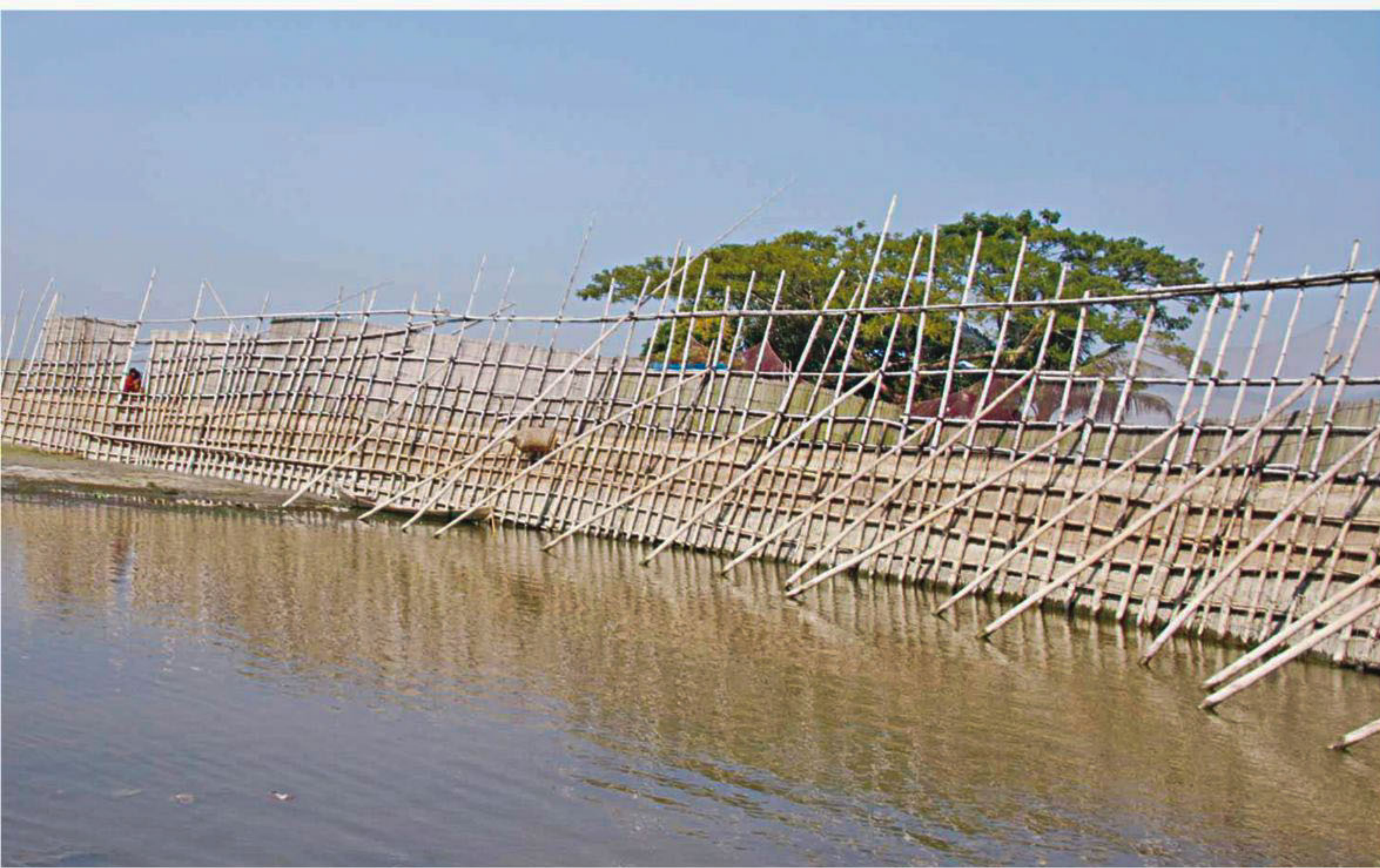
A section of influential people put bamboo enclosures, blocking the flow of this canal at Muchibari in Wazirpur upazila under Barisal district for fish cultivation, causing disturbance to irrigation in the nearby boro fields and stopping movement of boats in the locally important waterway.