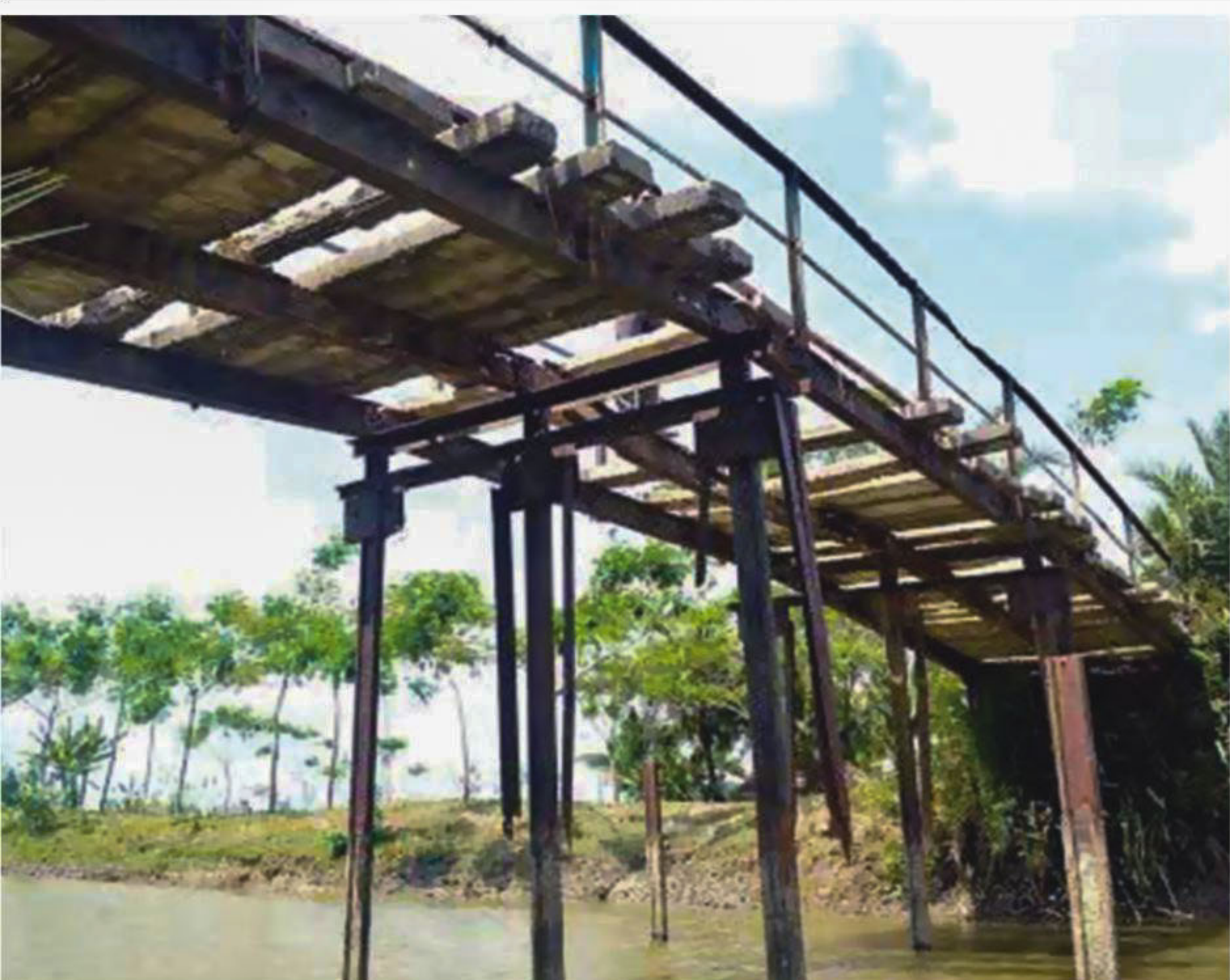
This iron bridge over Dora canal in Dhulasar union of Kalapara upazila under Patuakhali district has remained virtually unusable for the last two years, much to the sufferings of around 8,000 people of six villages.

"That time none opposed it and we have invested Tk 65 lakh for the purpose. Now seeing the prospect of our profit, some people are raising objections," he said.