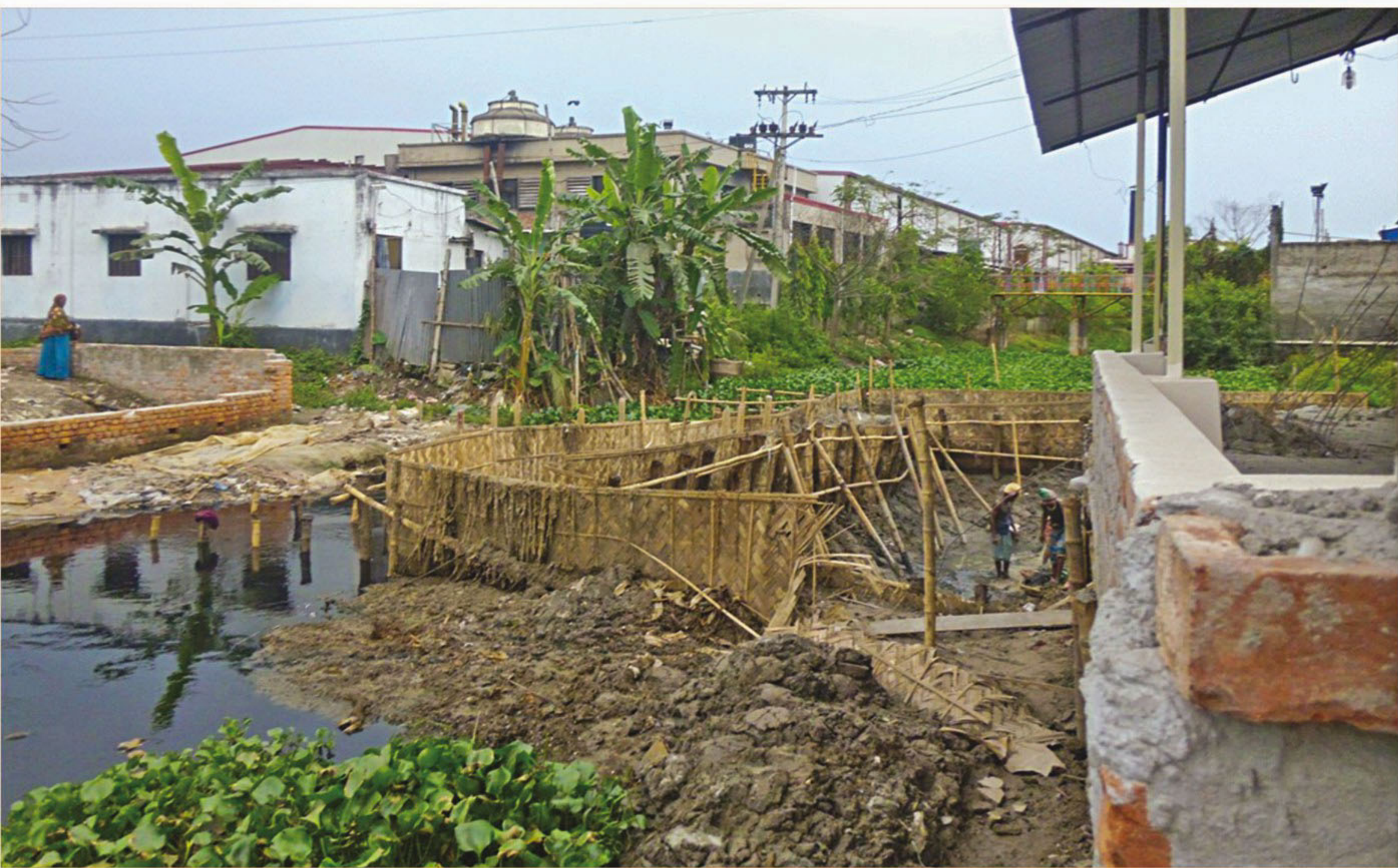
Grabbers closing in on a dying Nayanjuri Khal which in its yester years flowed with an average width of about 200-250 feet connecting the Bongshi and Turag rivers through Kaichabari, Baipail, Gazirchot, Zamgora and Yearpur union in Ashulia. In other sections, multi-storey buildings encroach on the canal, which the administration says is a recurrence following their drive last year and that they plan to recover the canal soon. The photo was taken at Baipail in Ashulia yesterday.