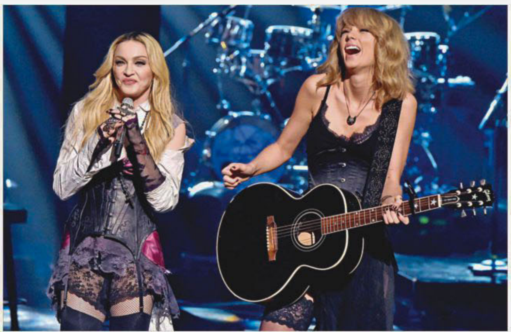
Madonna and Taylor swift perform together.

iHeartRadio also presented the versatile and multifaceted Timberlake with the Innovator award. In his speech, Timberlake quoted Steve Jobs' words "stay hungry, stay foolish" as ones that speak to his own career. Timberlake