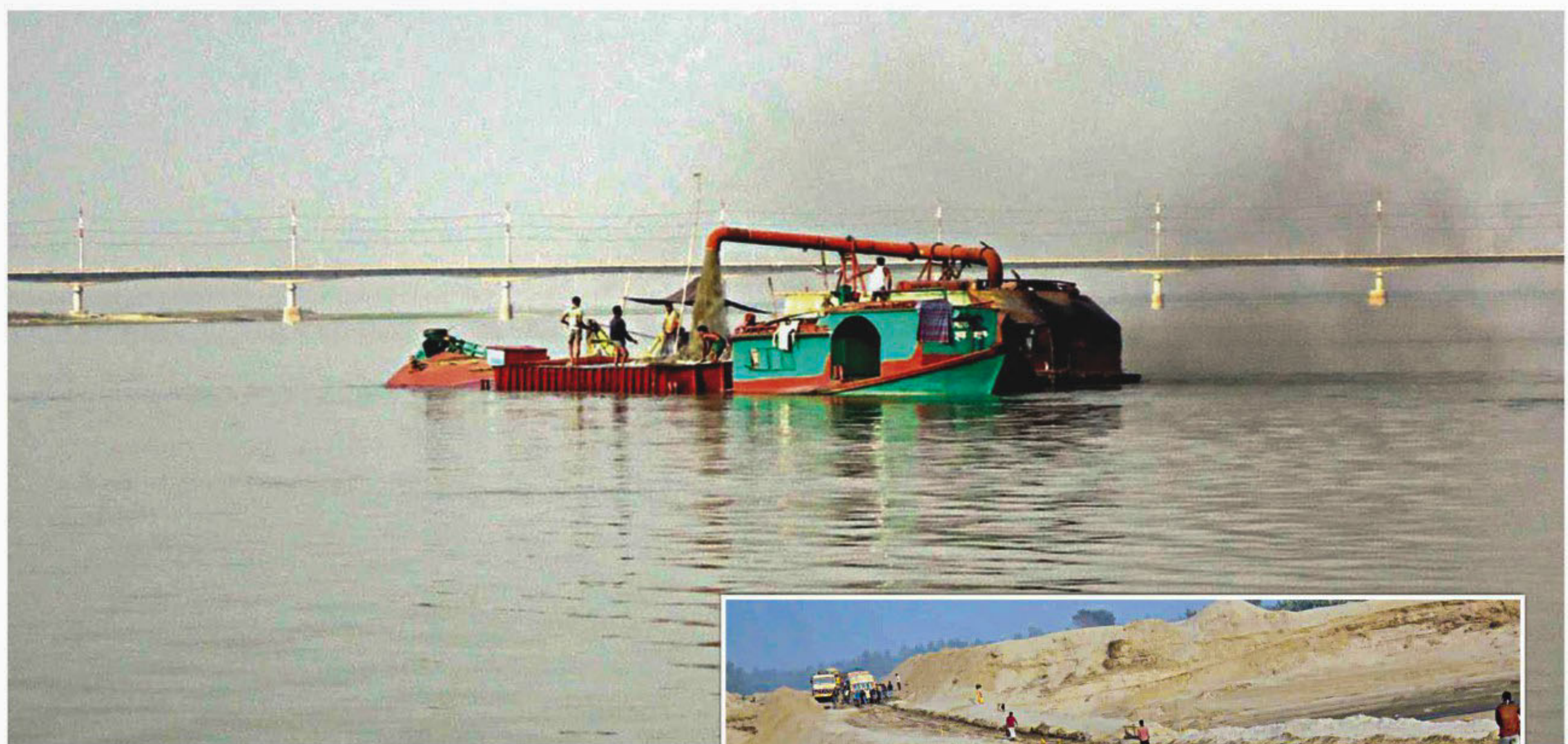
Sand lifting by dredgers continues unabated in the Jamuna, a few hundred metres from the Bangabandhu bridge. The act is prohibited within six kilometres from the bridge. Inset, a road built by traders across the new Dhaleshwari river, a tributary of the Jamuna, for transporting the lifted sand by trucks. The photos have been taken recently.

Sand-lifting at the site was suspended only a few months ago after The SEE PAGE 8 COL 5