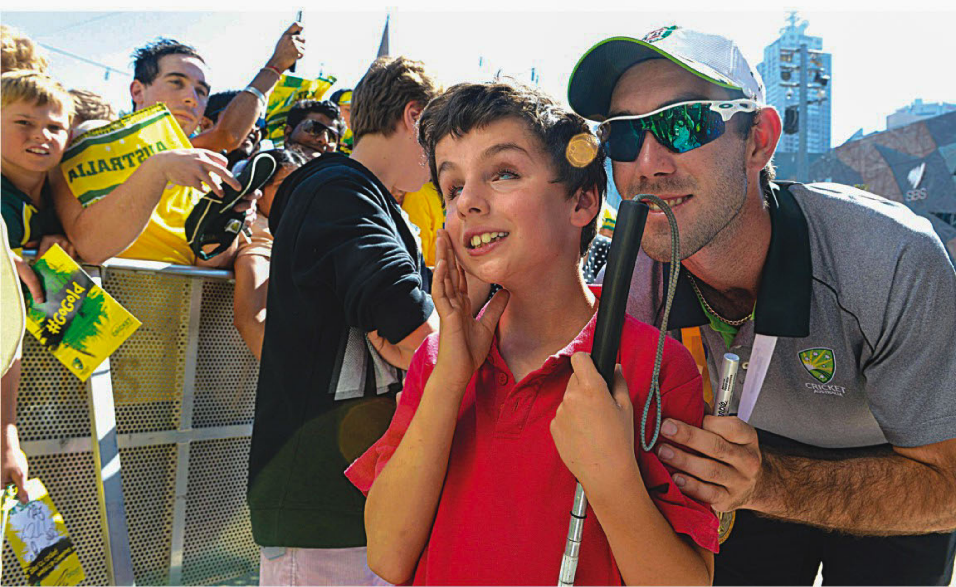
THE PHOTO HE WILL NEVER SEE: Cricketer Glenn Maxwell obliges a visually handicapped fan for a photograph during a public event to celebrate Australia's World Cup victory in Melbourne on Monday.