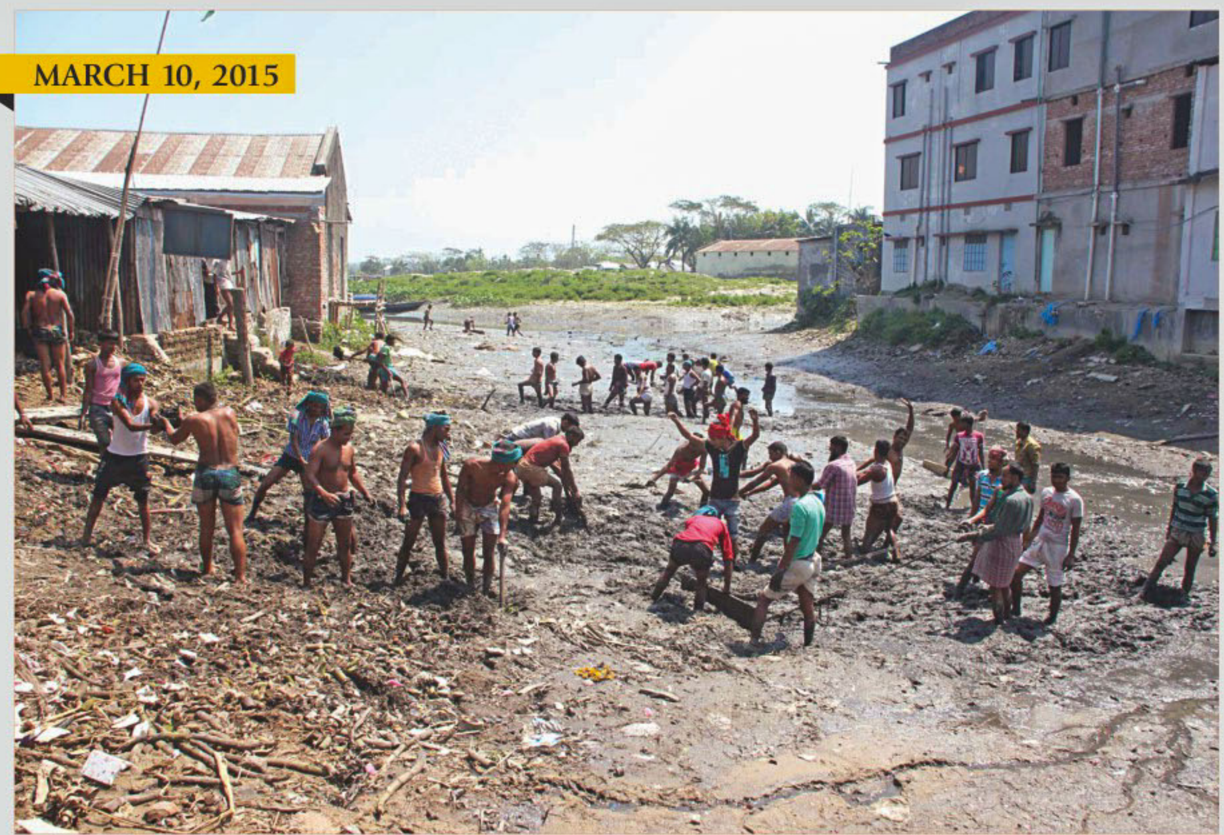
MARCH 10, 2015

Day and night temperatures may fall slightly over the country. The sun sets in the capital today at 6:13pm and rises tomorrow at 05:52am. Country's highest temperature 35.2 degree Celsius was recorded yesterday in Rajshahi and lowest 20.6 in Sayedpur.