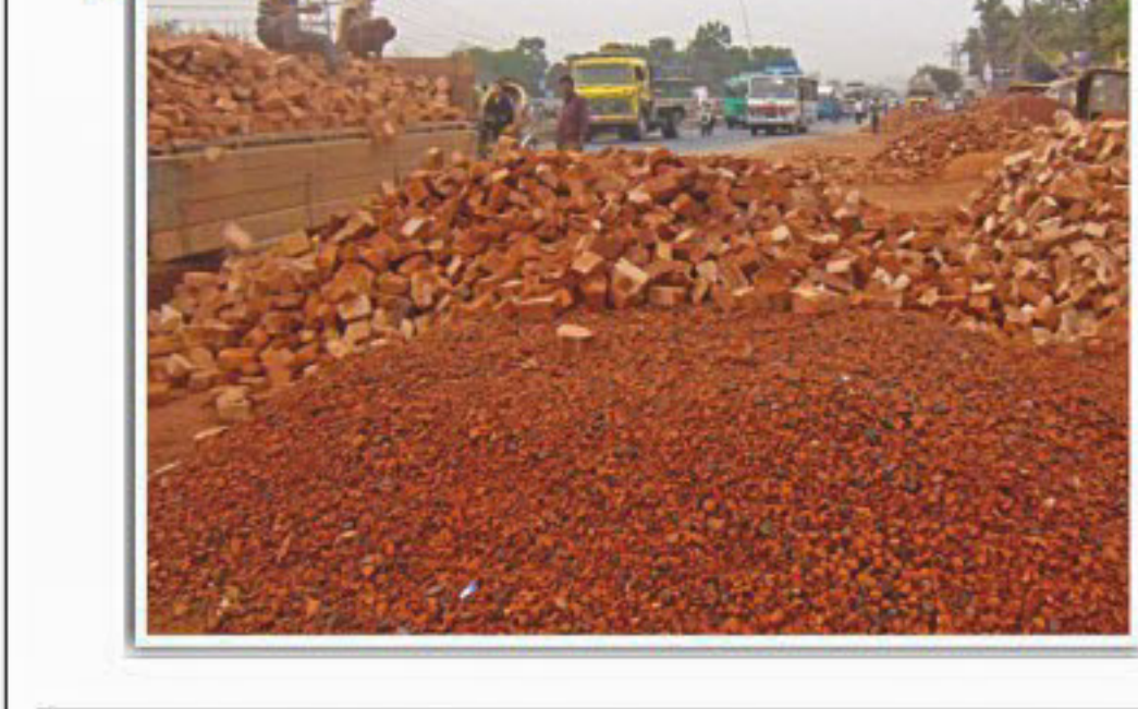
The busy Nabinagar-Chandra road connecting Savar and Gazipur was widened into four lanes more than one year ago considering the volume of traffic it handles daily, but the initiative has been effectively botched by local businessmen who have grabbed the roadside areas to sell bricks along a one and a half kilometres stretch. One trader said they were using the land, which belongs to the Roads and Highways Department, by 'winning' the backing of local ruling party thugs. He, however, did not name anyone. The photos were taken at Palashbari on Sunday.