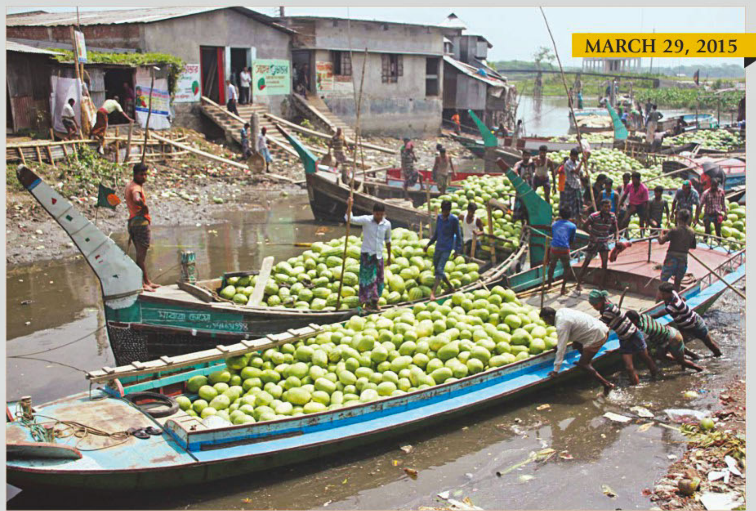
MARCH 29, 2015

The above two before-and-after photos show the sheer lack of apathy on the government's part in excavating a 400-yard section, from Hathkhola bridge to the Kirtankhola's edge, of the six-kilometre Jail canal in Barisal city despite being pointed out by The Daily Star on March 10 that over 100 local watermelon traders, frustrated after months of only empty assurances from the administration, had taken up the task and appointed workers, left, to give access to vessels carrying their products targeting the business' prime season, February to April. The photo on the right, taken yesterday, reveals that efforts on such a small scale prove to be futile when it comes to working with the ways of nature and that the government, and only itself, is adept at bringing an end to the traders' sufferings.