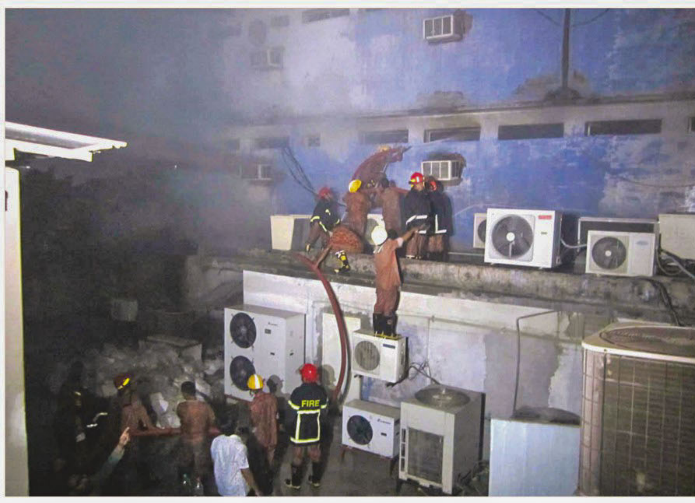
Firefighters battling a fire at the storehouse of Opsonin, a pharmaceutical company, in Barisal city yesterday. An electric short circuit initiated the fire around 2:15am, killing one person, injuring 14 and destroying Tk 5 crore worth of goods, said fire officials, in the next three hours when the flames ripped through the fifth-floor of the six-storey building before being put out.