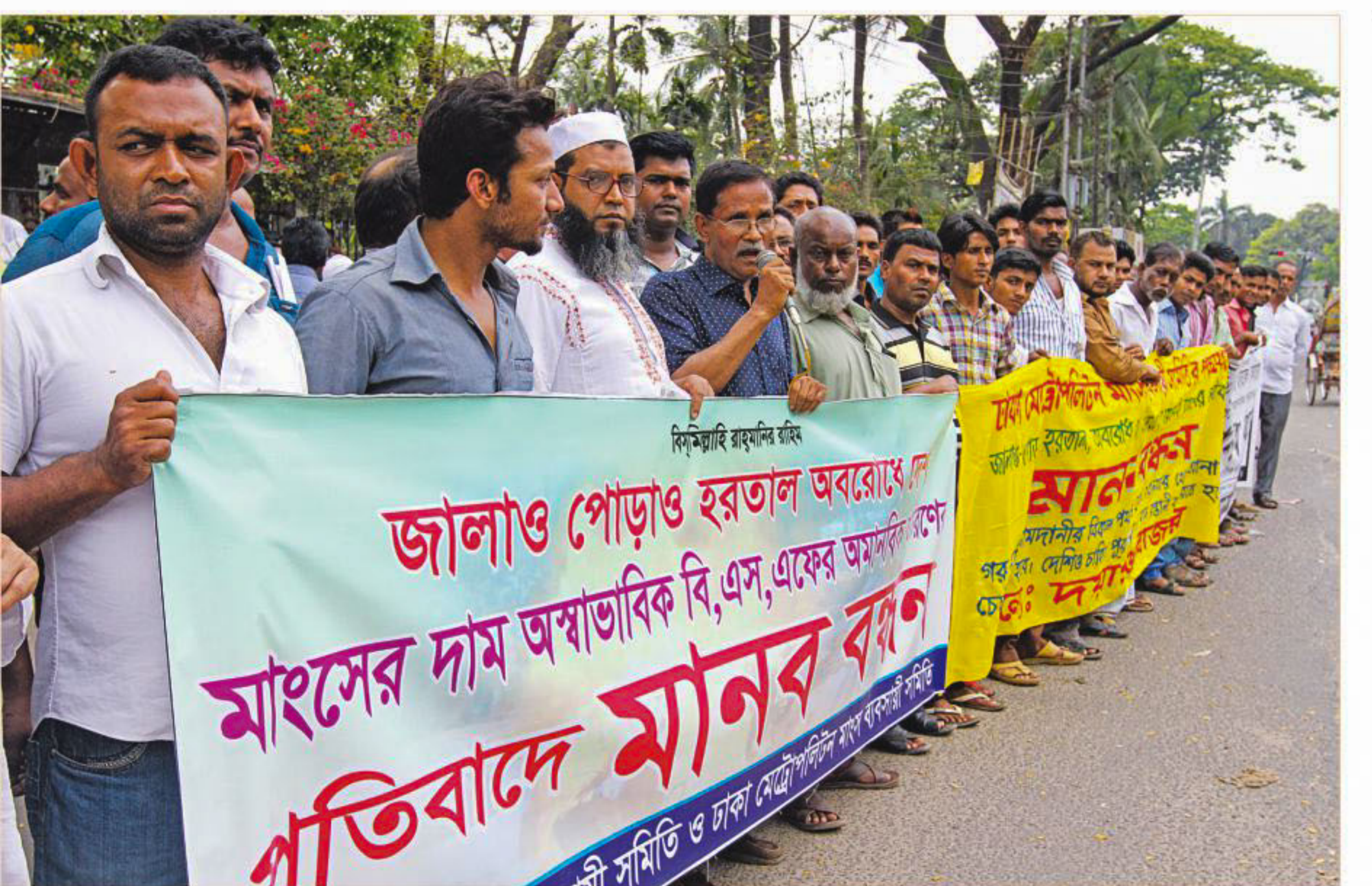
Bangladesh Meat Businesspersons' Association forms a human chain in front of Jatiya Press Club in the capital yesterday in protest against the price hike of meat due to shutdowns, and "overzealous strictness of Indian Border Security Force (BSF)" during importing of cattle from the country.