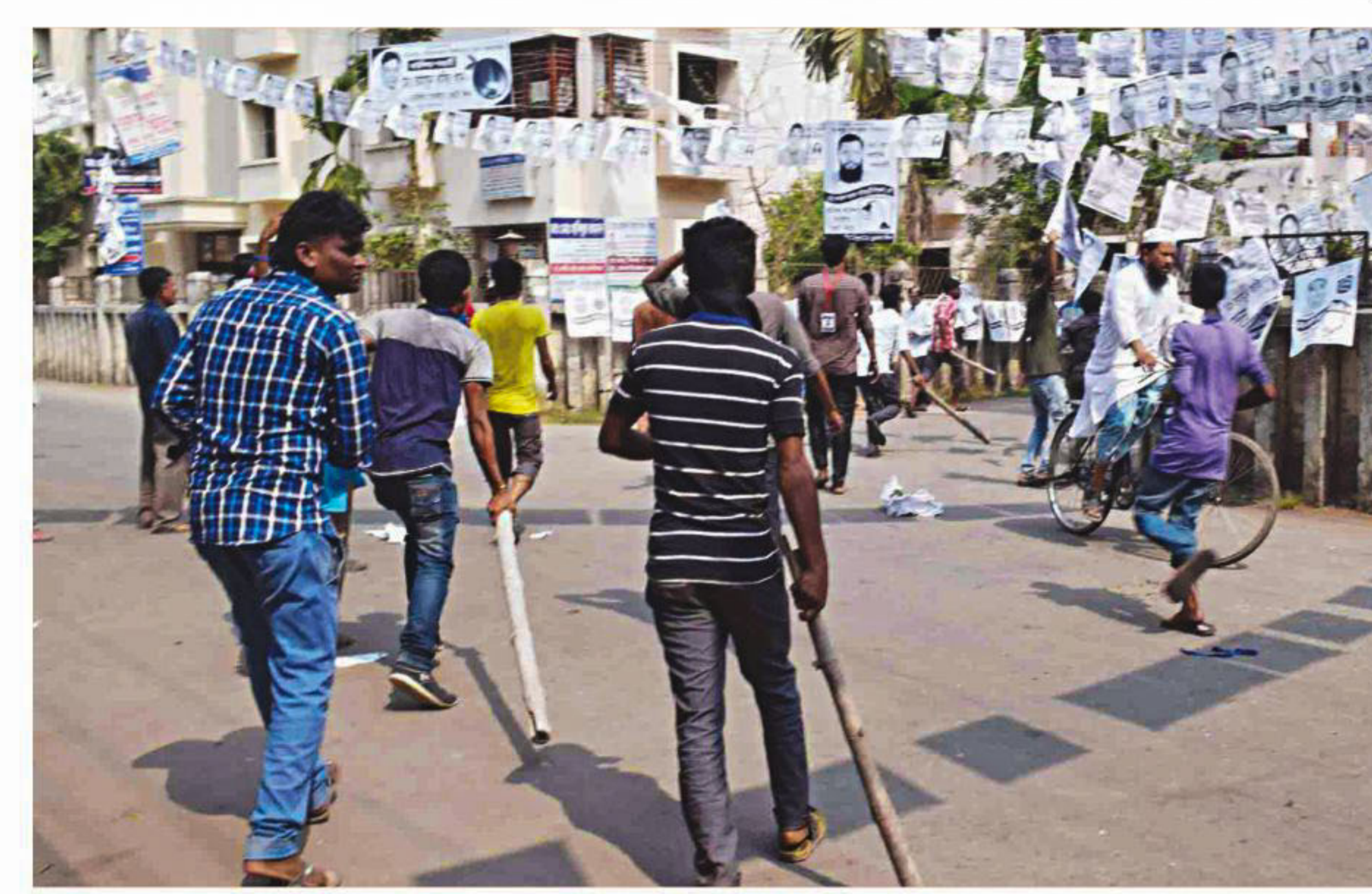
Men armed with bamboo poles enter a polling centre in Lady Protima Mitra Girls High School in Chandpur yesterday as supporters of two councillor candidates clashed inside during elections to the municipality, suspending voting there for one and a half hours.