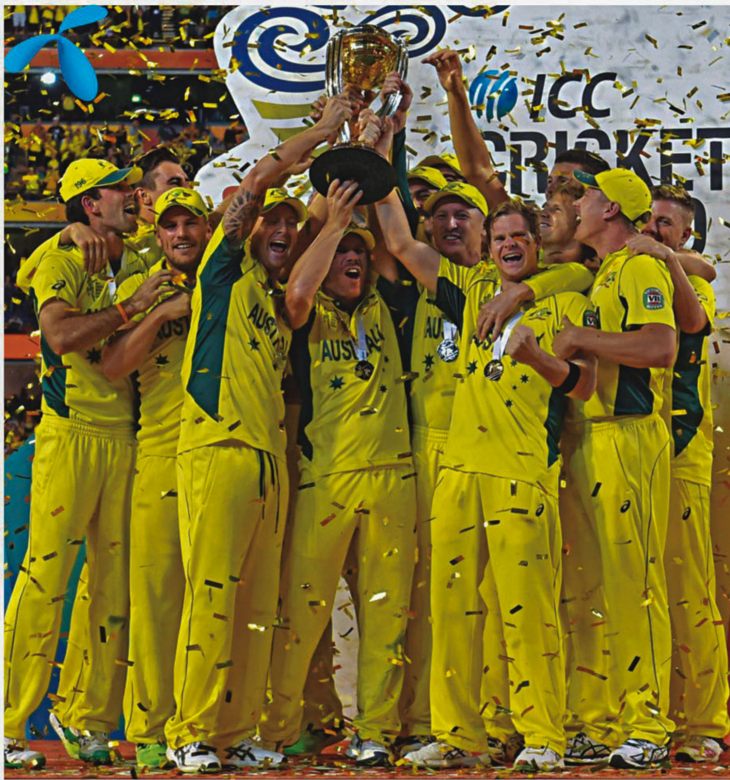
THE CLASS OF 2015: Australia cricketers party with the ICC Cricket World Cup trophy after beating trans-Tasman rivals New Zealand in the final in Melbourne yesterday.

"If anyone violates the code of conduct, we will take necessary action as SEE PAGE 8 COL 5