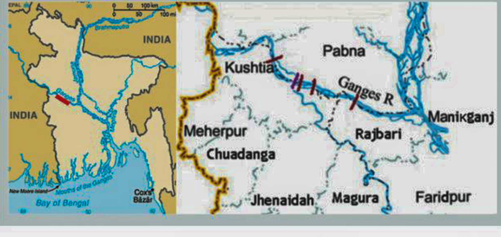
Ganges Barrage Location

The proposed project has a reservoir to augment the flow of water and its equal distribution, in both dry and wet season, over the Ganges