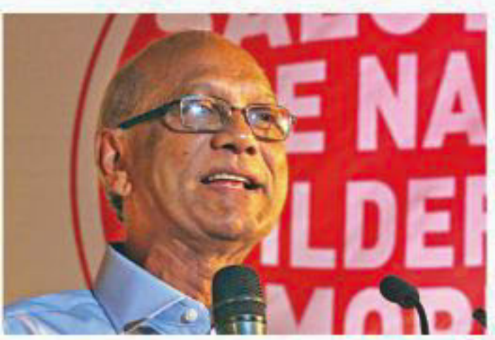
Nurul Islam Nahid