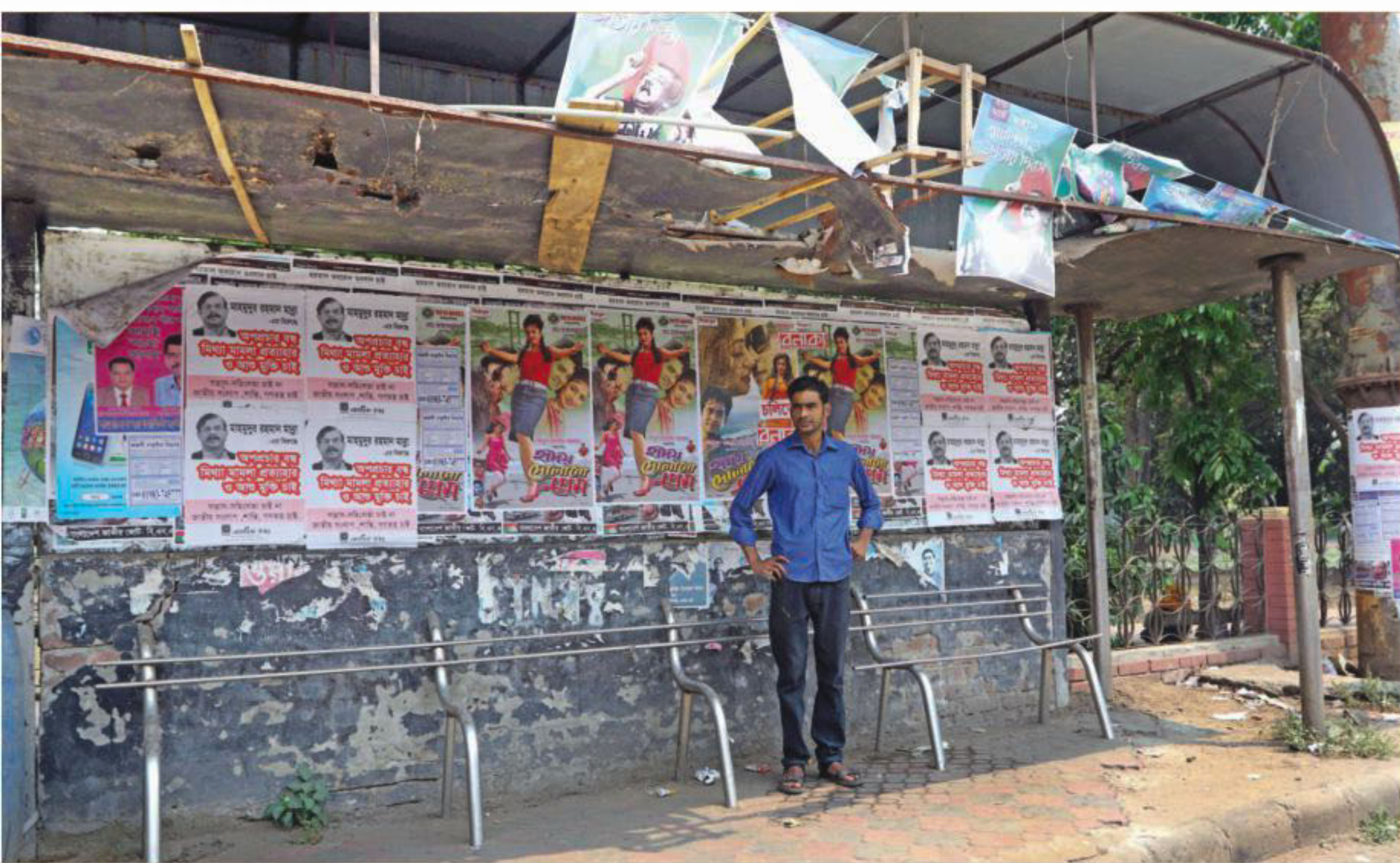
A man stands in what is supposed to be a metal seat built for passengers waiting for buses, showing the irony of the situation. The photo was taken yesterday at Ramna Park in the capital.