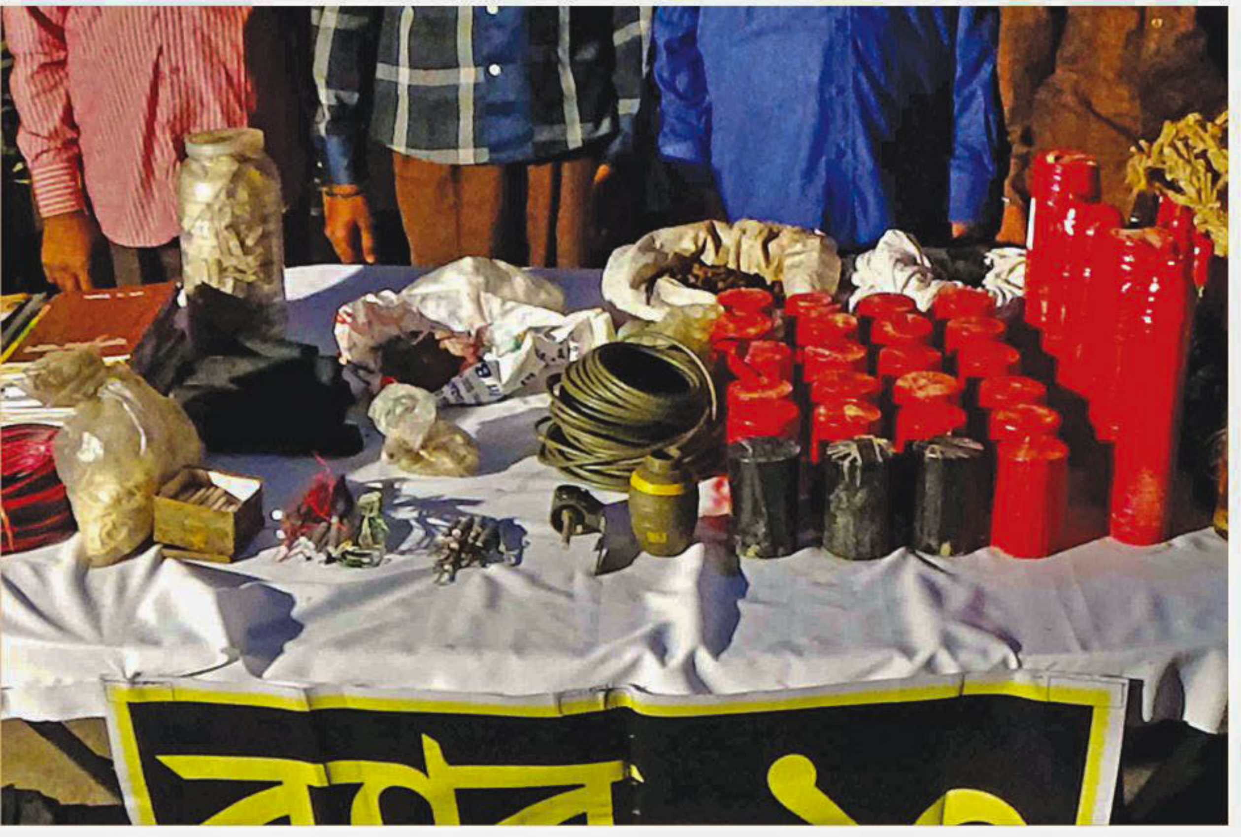
Rab displays the grenades, bombs and bomb-making materials recovered from a house in the capital's Dakkhin Khan area early yesterday. During the raid, the crime busters arrested four operatives of banned outfit Jama'atul Mujahideen Bangladesh. The photo was taken at the Rab headquarters in Uttara.