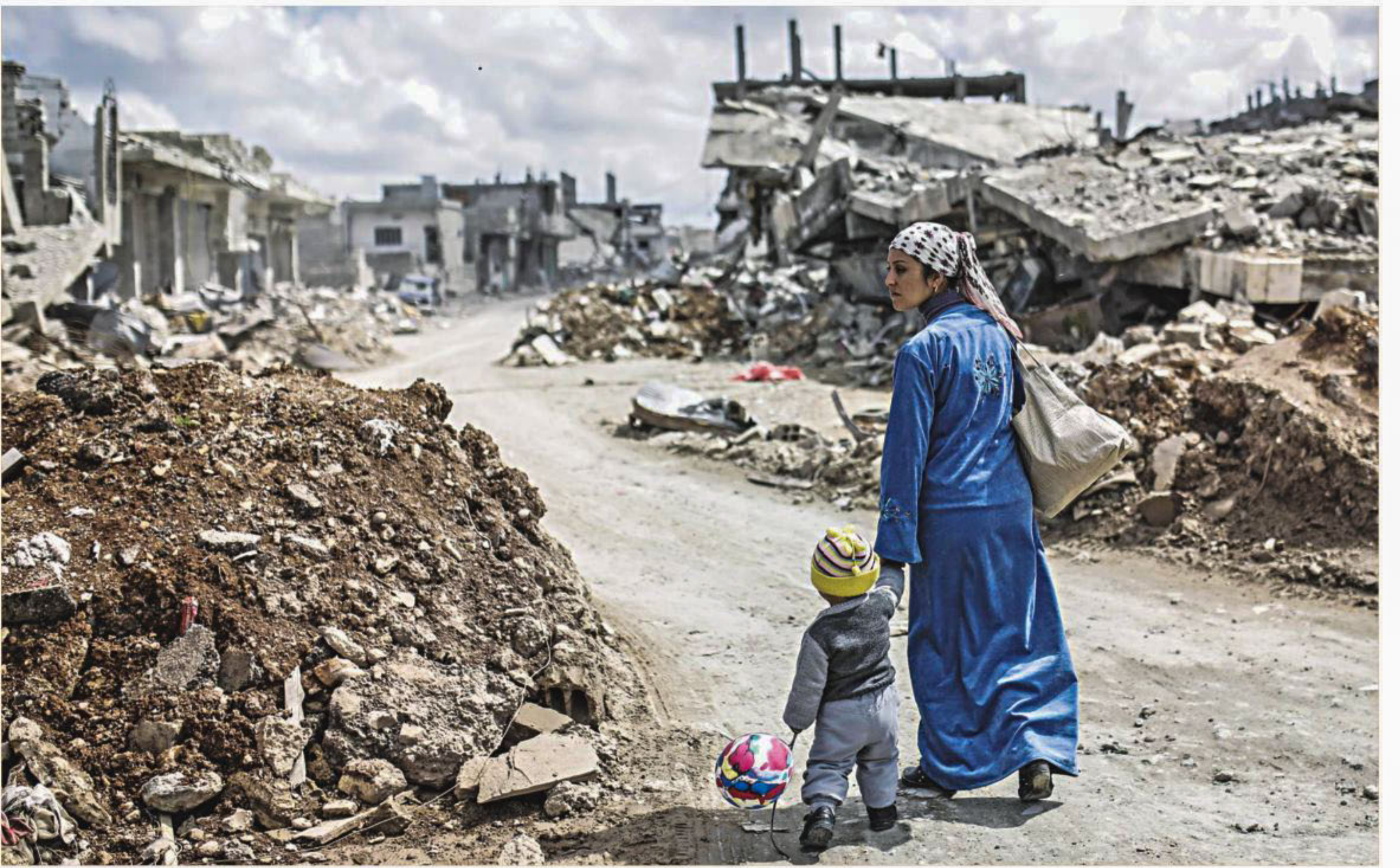
A Kurdish Syrian woman walks with her child past the ruins of the town of Kobane, also known as Ain al-Arab, on Wednesday. The number of asylum-seekers in industrialised countries rose by nearly half last year, driven by the devastating conflicts in Syria and Iraq, with Germany the top destination, the UN refugee agency said yesterday.