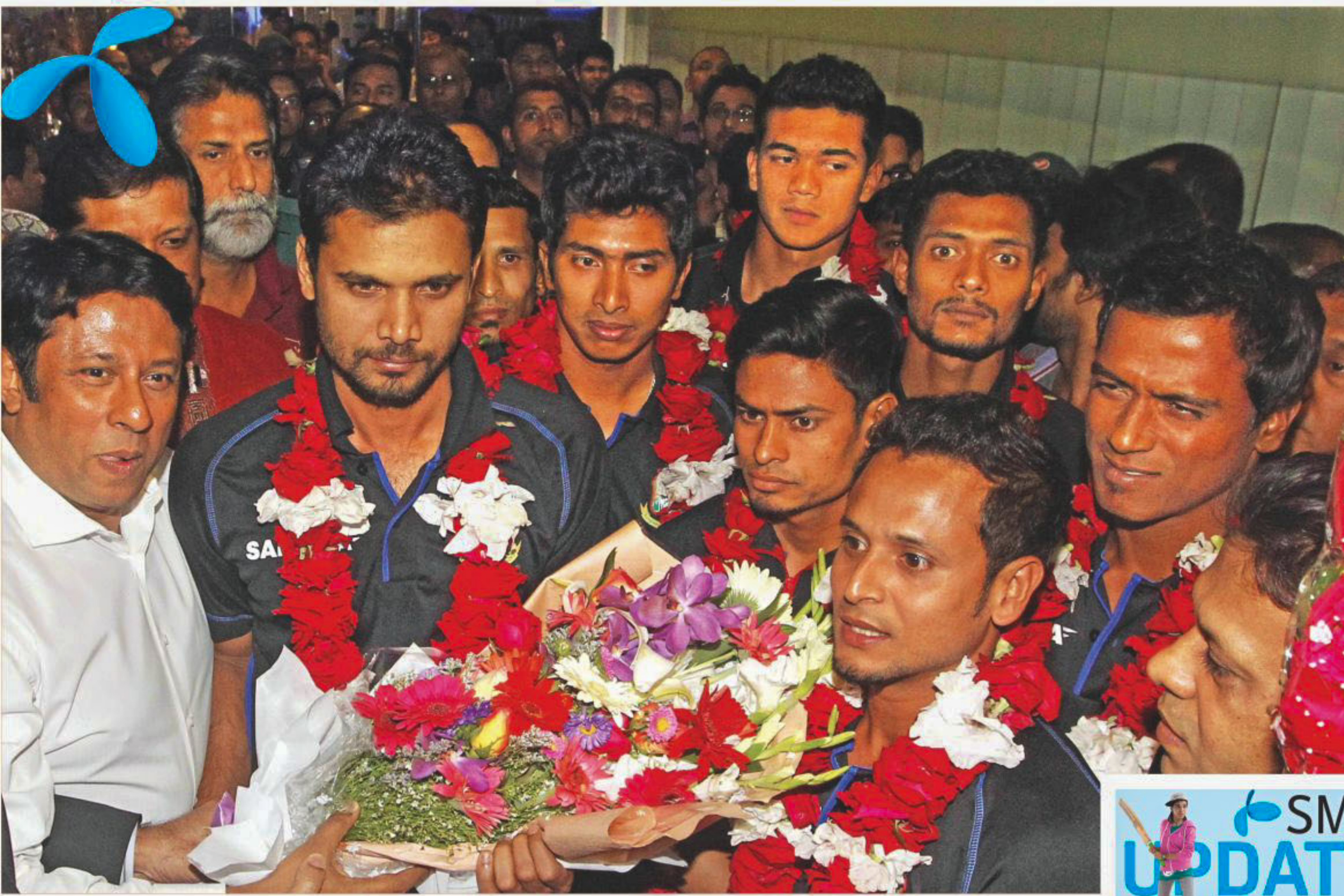
Captain Mashrafe Bin Mortaza is greeted with flowers upon the Bangladesh team's arrival at the Hazrat Shahjalal International Airport last night.