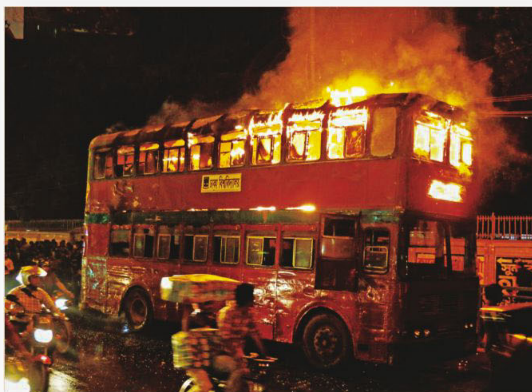
A double-decker of Dhaka University burns at Farmgate in the capital after criminals torched it yesterday evening.