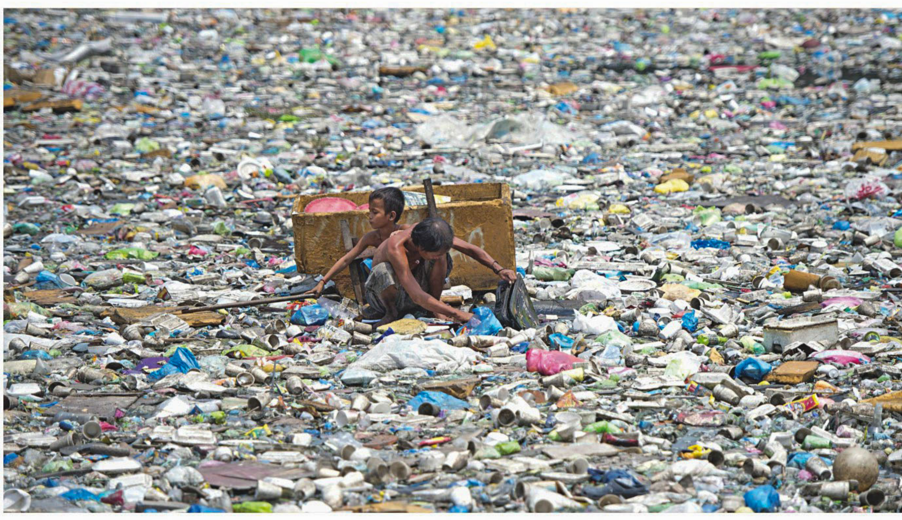
A father and son on a makeshift boat made from styrofoam paddle through a garbage filled river as they collect plastic bottles that they can sell in junkshops in Manila, yesterday. The Philippines will be observing World Water day on March 22, a global event that focuses on finding access to clean and safe water. In an annual report, the UN said abuse of water was now so great that on current trends, the world will face a 40-percent "global water deficit" by 2030 -- the gap between demand for water and replenishment of it.

AFP, Moscow Representatives of Syrian President Bashar al-Assad and opposition figures will meet for peace talks in Moscow on April 6, a Russian foreign ministry spokesman told AFP. The ministry spokesman did not specify which opposition representatives and officials from Assad's government would attend the talks.