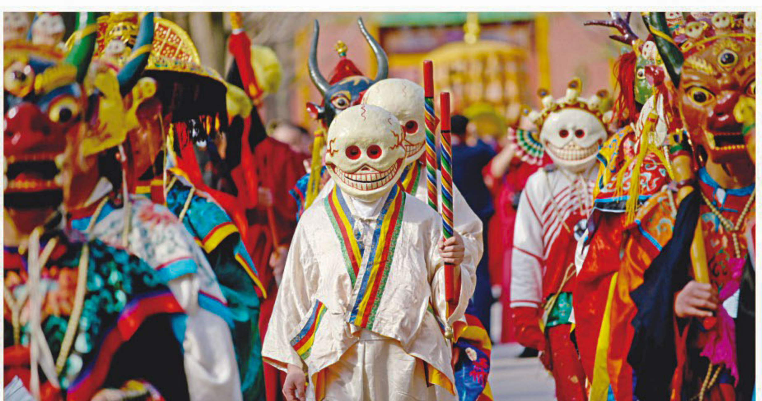
Tibetan monks dressed as demons attend the Beating Ghost festival at the Yonghe Temple, also known as the Lama Temple, in Beijing, yesterday. The Beating Ghost festival, or Da Gui festival in Chinese, is an important ritual of Tibetan Buddhism and is believed to expel evil spirits and shake off troubles.