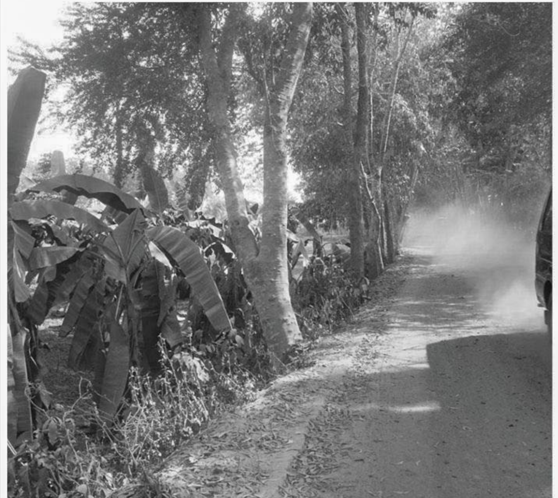
Dust from the incomplete portion of the damaged road in Kaliganj upazila of Jhenidah district causes nuisance for locals, in addition to harming trees and plants in the adjacent areas.

Contractor Shahinur Alam said, "I could not complete the five-kilometre portion of the road due to various complexities. I will complete the work soon."