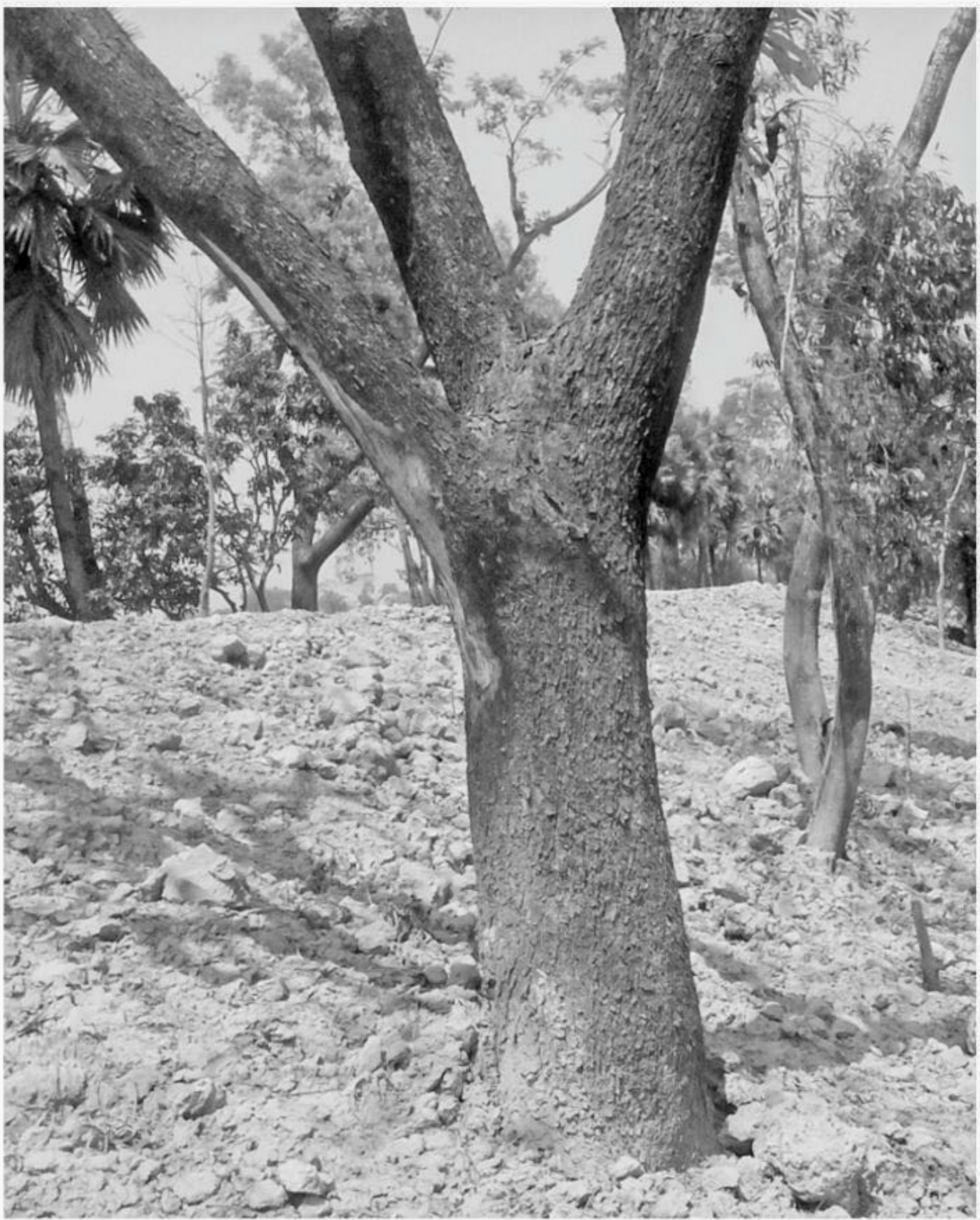
These trees, like over 4000 others planted between 1999 and 2011 on Water Development Board's embankments in Amtali upazila of Patuakhali district, have been officially shown to have wood measuring only two cft each on an average, before preparation to sell them at auction.

As this correspondent visited several spots on Wednesday, locals expressed dissatisfaction over the