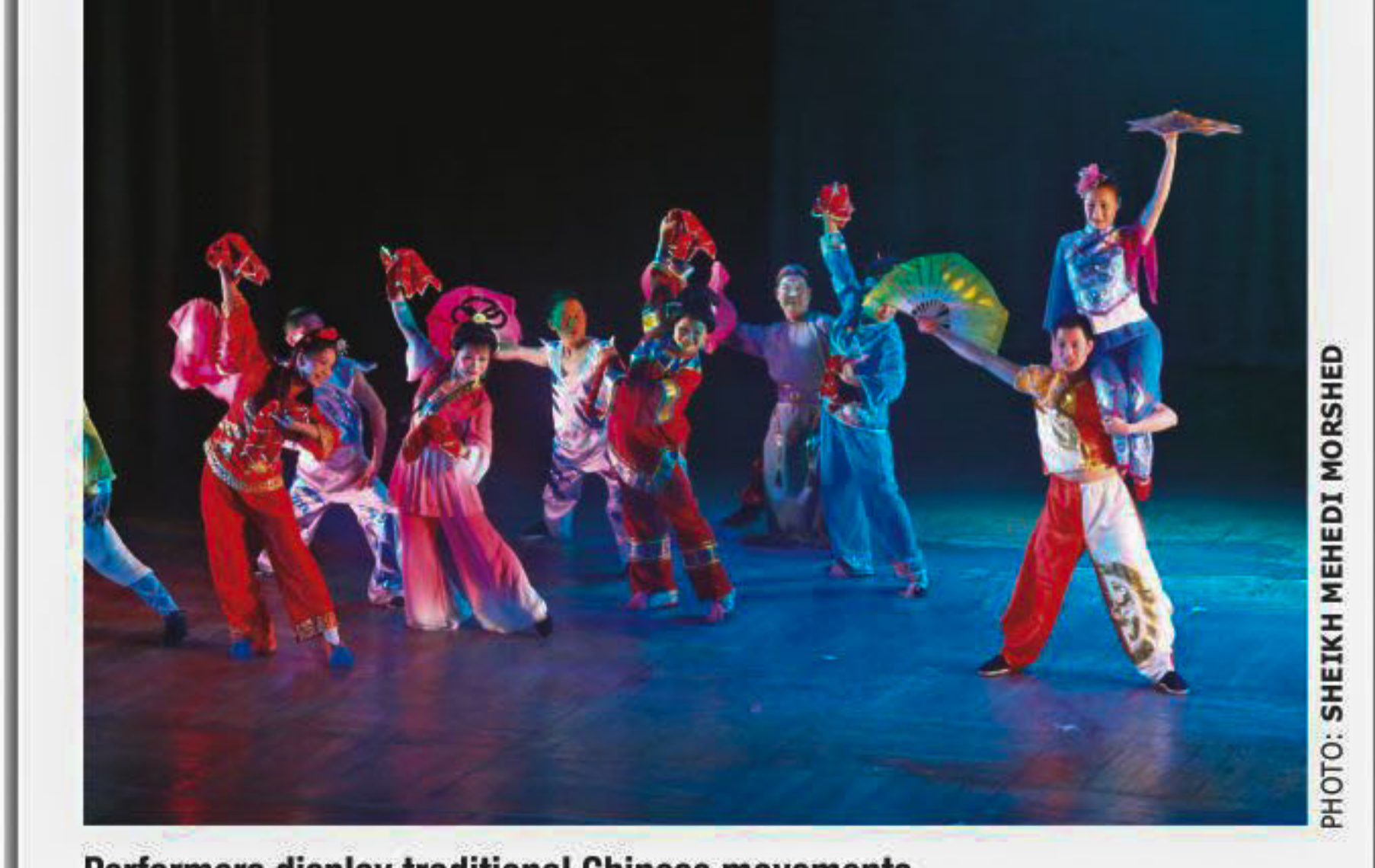
Performers display traditional Chinese movements.

The second story, "Romance in beating the birds", is a romcom showing how a young man and woman date. It shows Wang San who falls in love with Mao Gu. They cannot meet as the local convention forbids their love.