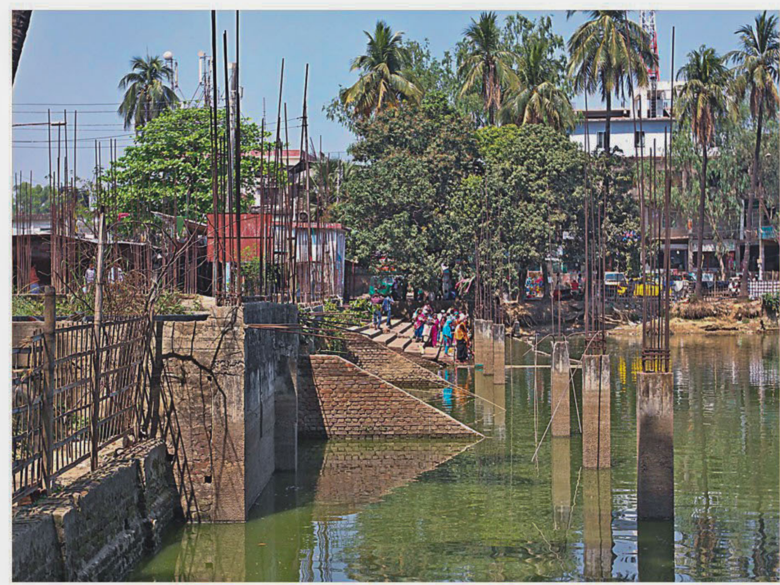
Clockwise from left, concrete pillars erected, for construction of a mosque, inside the pond of Hazrat Bayezid Bostami shrine in Chittagong city, the habitat of the rare Bostami Turtle, which has already been declared extinct in the wild and is believed to be surviving only in Bangladesh and India. Another threat is water pollution, largely caused by unsupervised feeding of the animals by visitors. Though the wildlife management division supports the breeding programme, a forest official said there had been no instructions to protect the endangered species.

FROM PAGE 3 Dighinala to protest the setting up of the BGB offices which, they claim, were built evicting indigenous families. ASK demanded that the government release the arrestees and resolve the problem after discussions with the indigenous people before constructing any establishment in the hilly areas. At least six indigenous people and four members of the joint forces were injured in the clash.