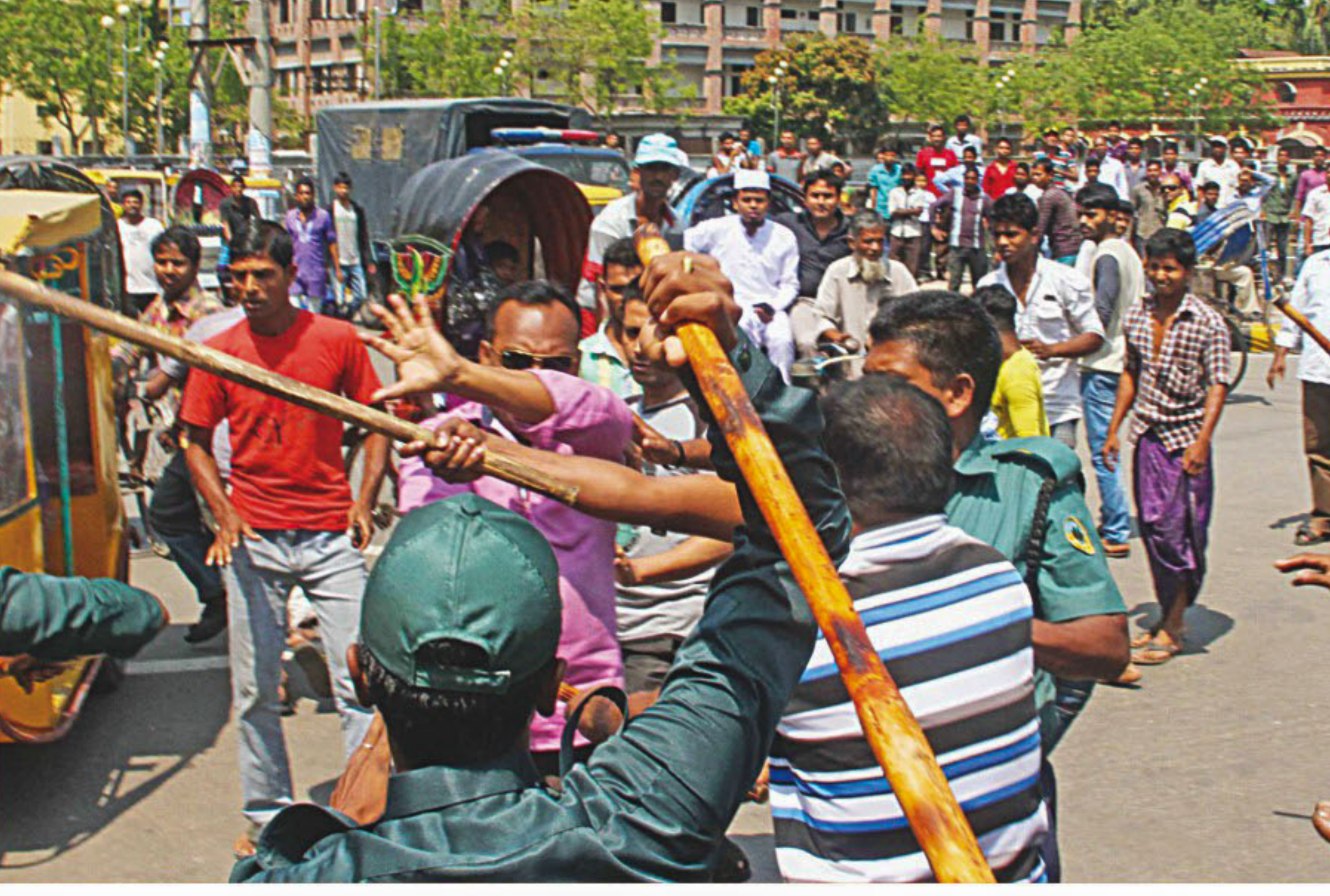
Police using batons to stop a clash between the drivers of battery-powered three-wheelers and guards of Barisal City Corporation yesterday in front of the city corporation office over seizure of the vehicles. The fighting left at least 10 people from both sides injured.