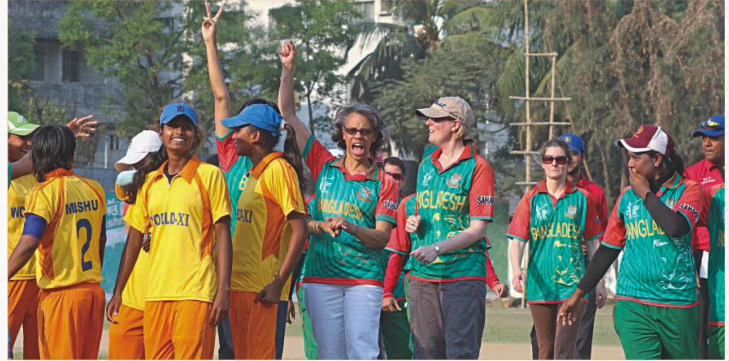
The tiny City Club ground in Mirpur yesterday turned into a high-profile venue, where foreign diplomats joined in unison with the members of Brac's Kishori Unnayan Club in a game of cricket to observe the International Women's Day as well as celebrate the success of the Tigers in the on-going World Cup down under.

SURESH RAINA India's lower-middle order had hardly been tested in the first five matches of World Cup, thanks to the top four, who had scored the bulk of runs be it setting up a total or chasing. But it was different scenario yesterday against Zimbabwe as the Indians found themselves in a bit of bother, losing first three for just 71 runs, chasing a challenging target of 288. That's when Suresh Raina arrived at the crease, and even after the fall of Virat Kohli some 21 runs later, managed to bail India out with an unbeaten century. The left-hander scored 110 runs off 104 balls, with nine boundaries and four maximums, and forged an unbroken fifth wicket stand of 196 runs with skipper Mahendra Singh Dhoni to ensure India's sixth win on the trot.