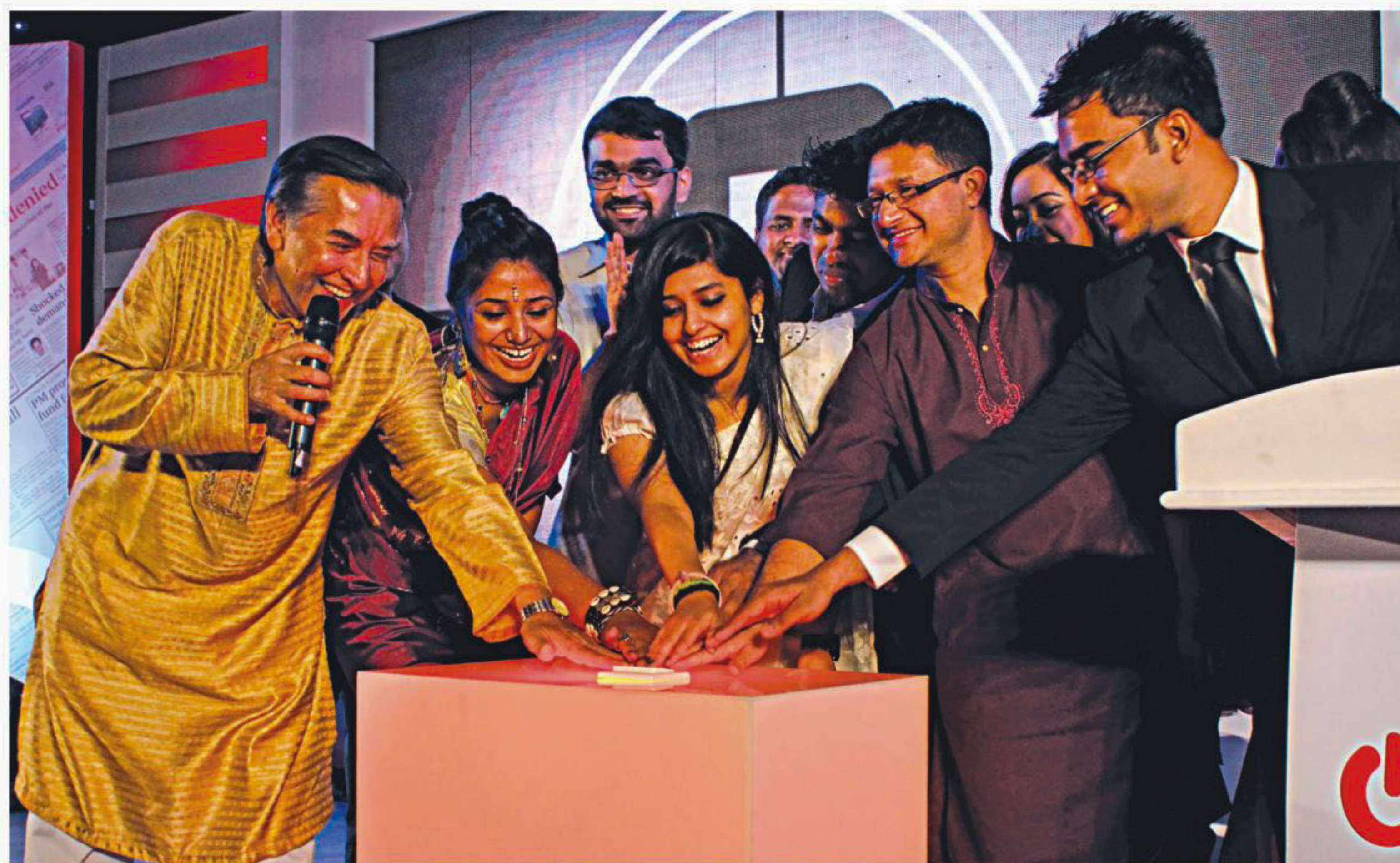
A number of young achievers in their own fields push a buzzer with The Daily Star Editor Mahfuz Anam to inaugurate the newspaper's new website during 24th anniversary celebrations of the paper at Bangabandhu International Conference Centre yesterday evening.

She said the newspaper has brought significant changes PHOTOS ON PAGE 2 SEE PAGE 8 COL 2