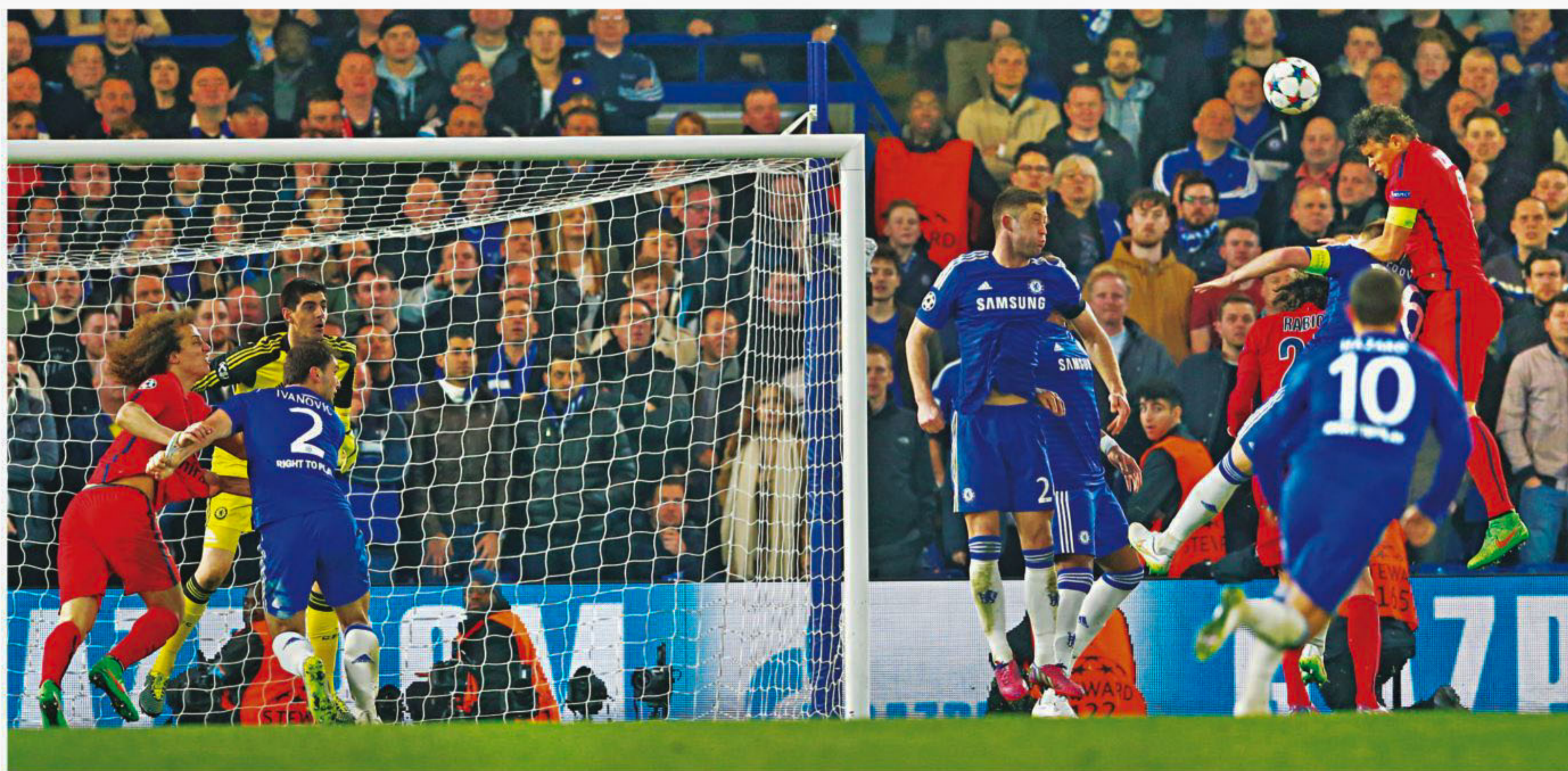
PSG captain Thiago Silva (R) heads in the second goal against Chelsea during their Champions League round of 16 encounter at Stamford Bridge on Wednesday.

What his charges love most that he is not monotonous in his thinking and he exerted that idea when he said: "We don't stick to the same plan. We are not afraid to rethink our game plan and our combination as well. Our batting and my bowling coach, we have some ideas, but, again, the goal is to go ahead and execute."