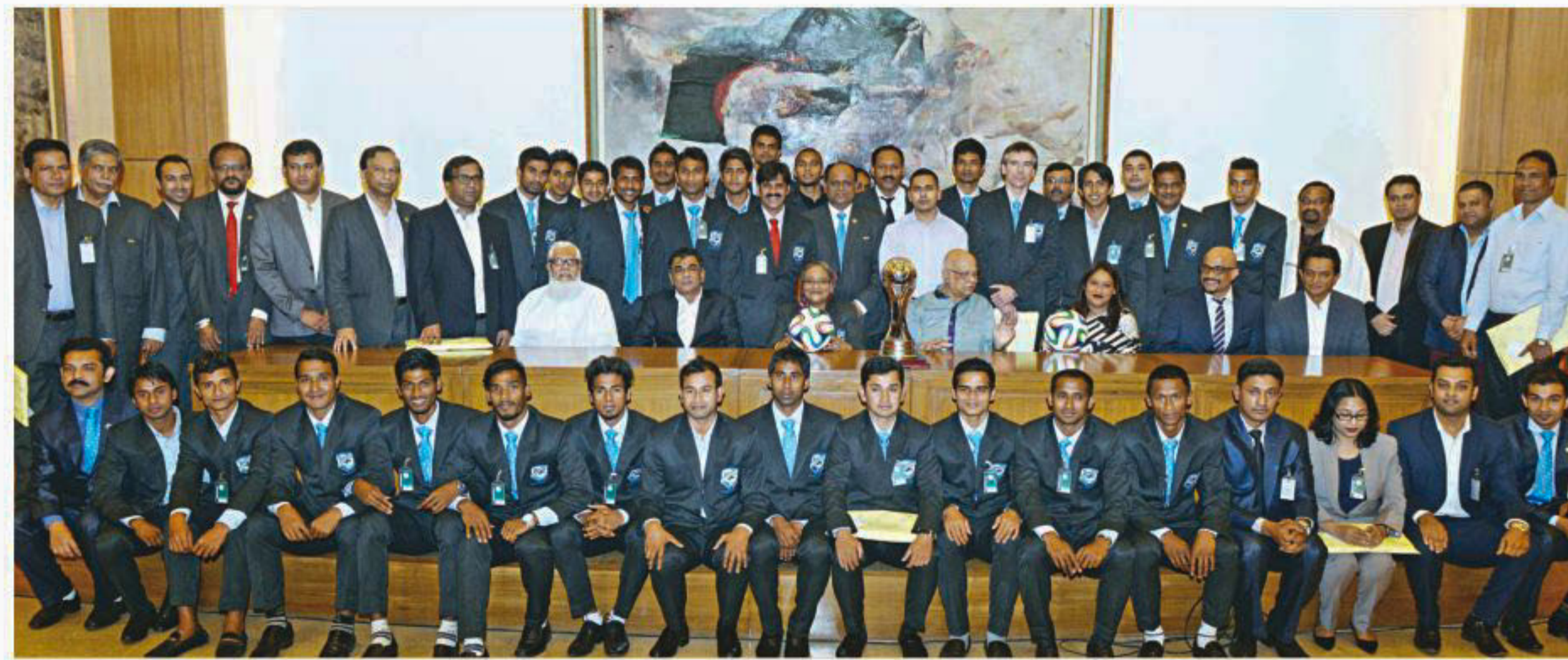
Players and officials of Bangladesh football team pose with Prime Minister Sheikh Hasina during a ceremony at Gono Bhavan yesterday.