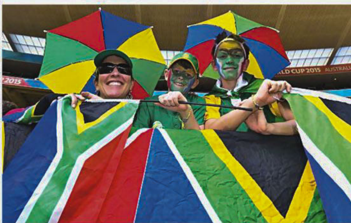
Some Protea fans enjoyed yesterday's game, but the highlight in Wellington was a robot that roamed around the streets with its metal cricket bat.