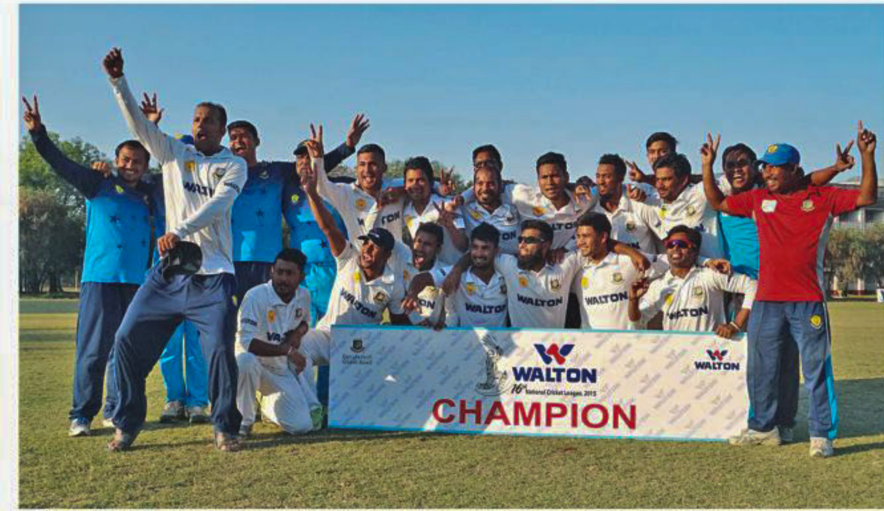
Rangpur Division celebrate their first National Cricket League triumph, as they won on the last day of the tournament yesterday.