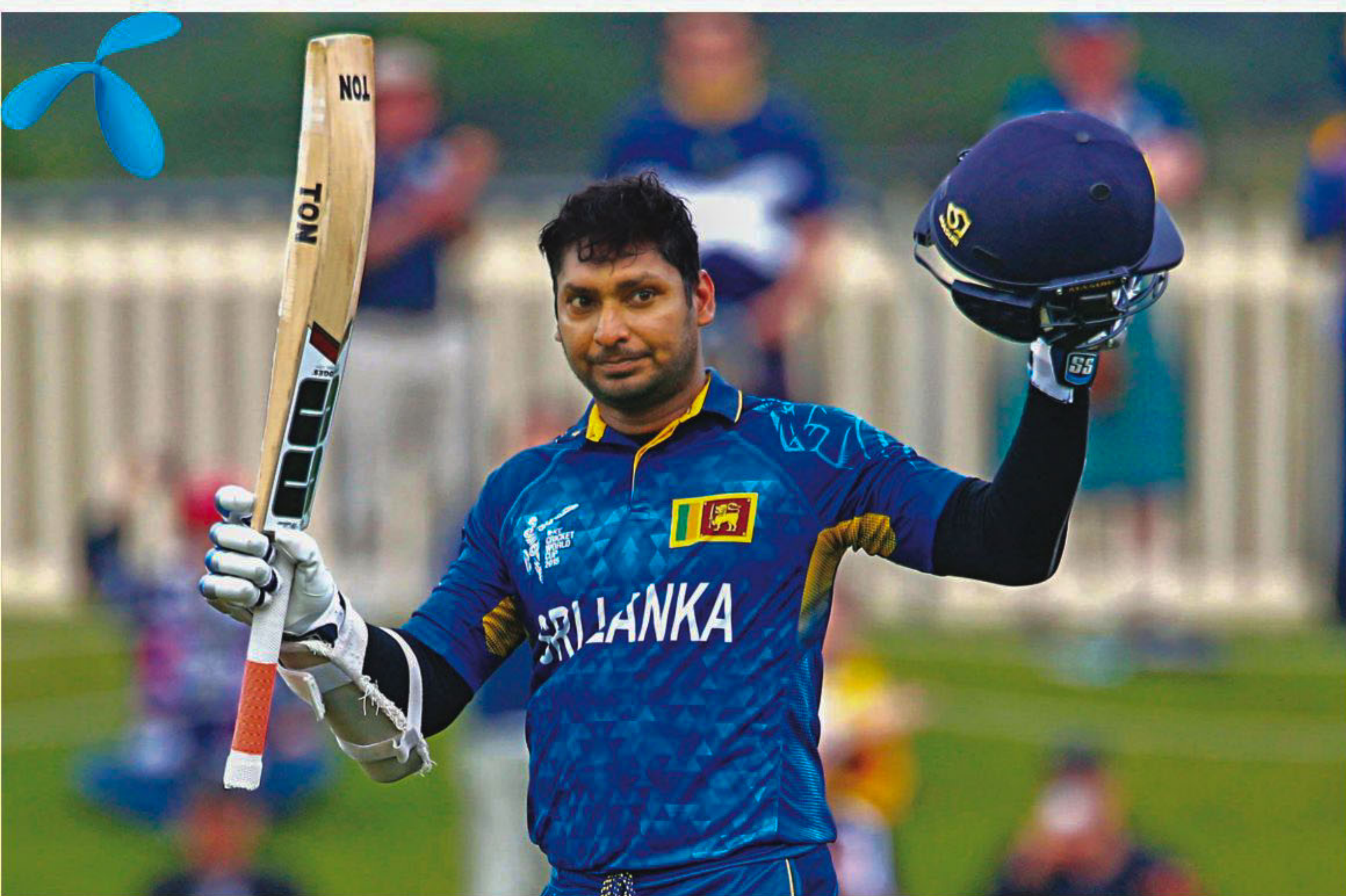
Kumar Sangakkara never crushes records, he creates those. The magnificent Sri Lankan left-hander struck a sublime 124, his fourth consecutive century in this World Cup, against Scotland in Hobart yesterday. It's an effort that made him the only player in ODI history to achieve that feat on a day he also toppled Australia's Adam Gilchrist as the most successful wicketkeeper with 54 WC dismissals.

is out today. Make sure you get your copy of this supplement free of charge, from your hawkker. We at The Daily Star are always striving to serve our readers and patrons better.