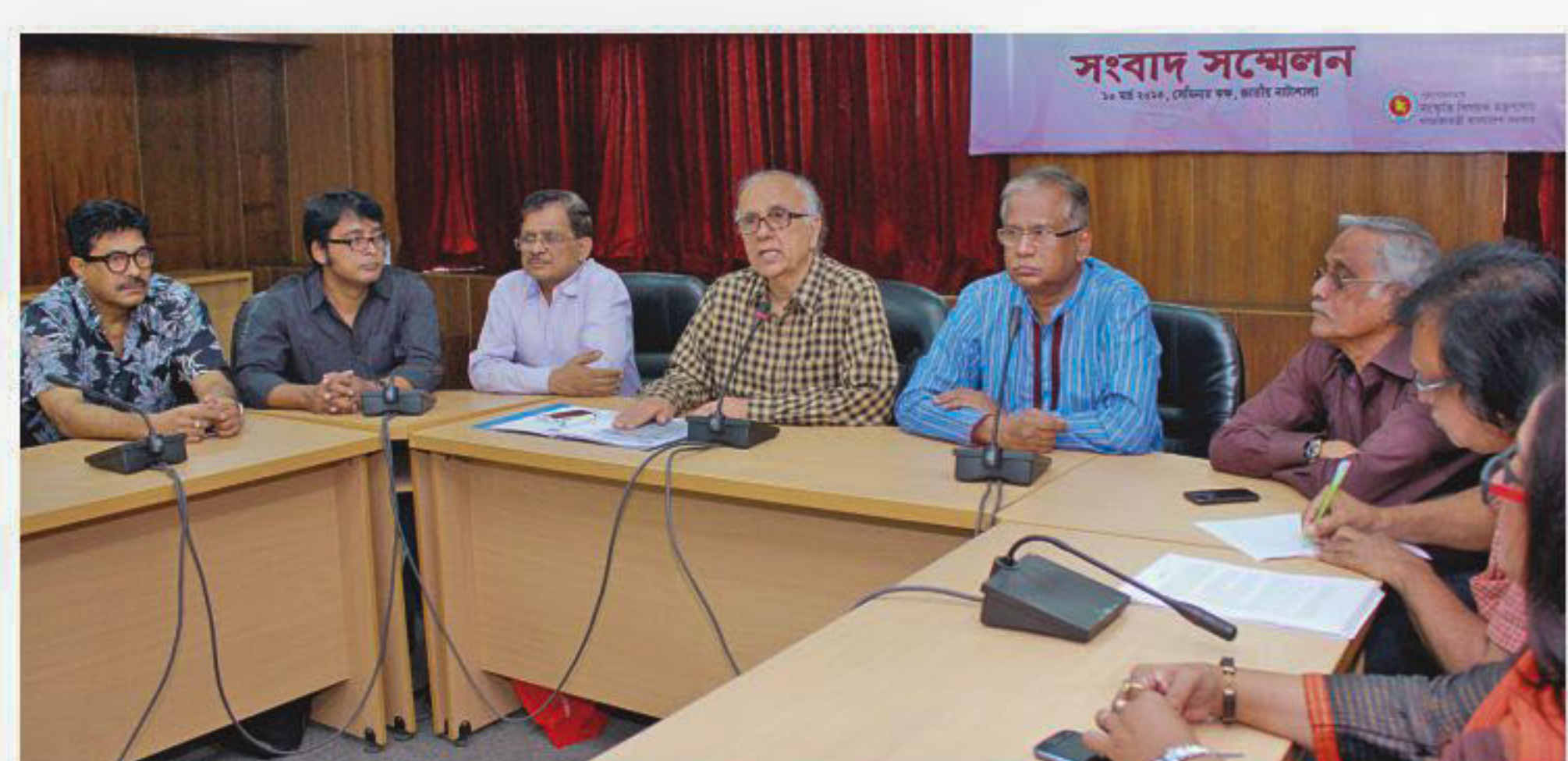
Organisers at the press conference.