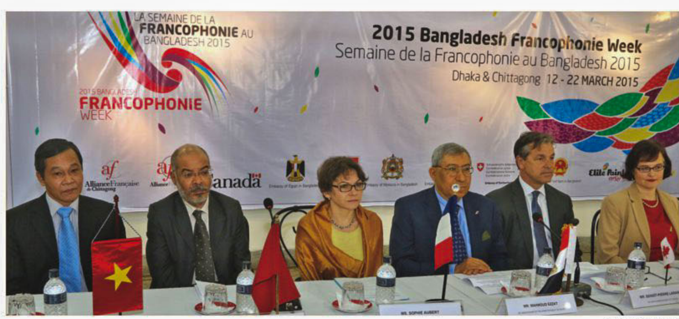
Diplomats speak at the press conference.