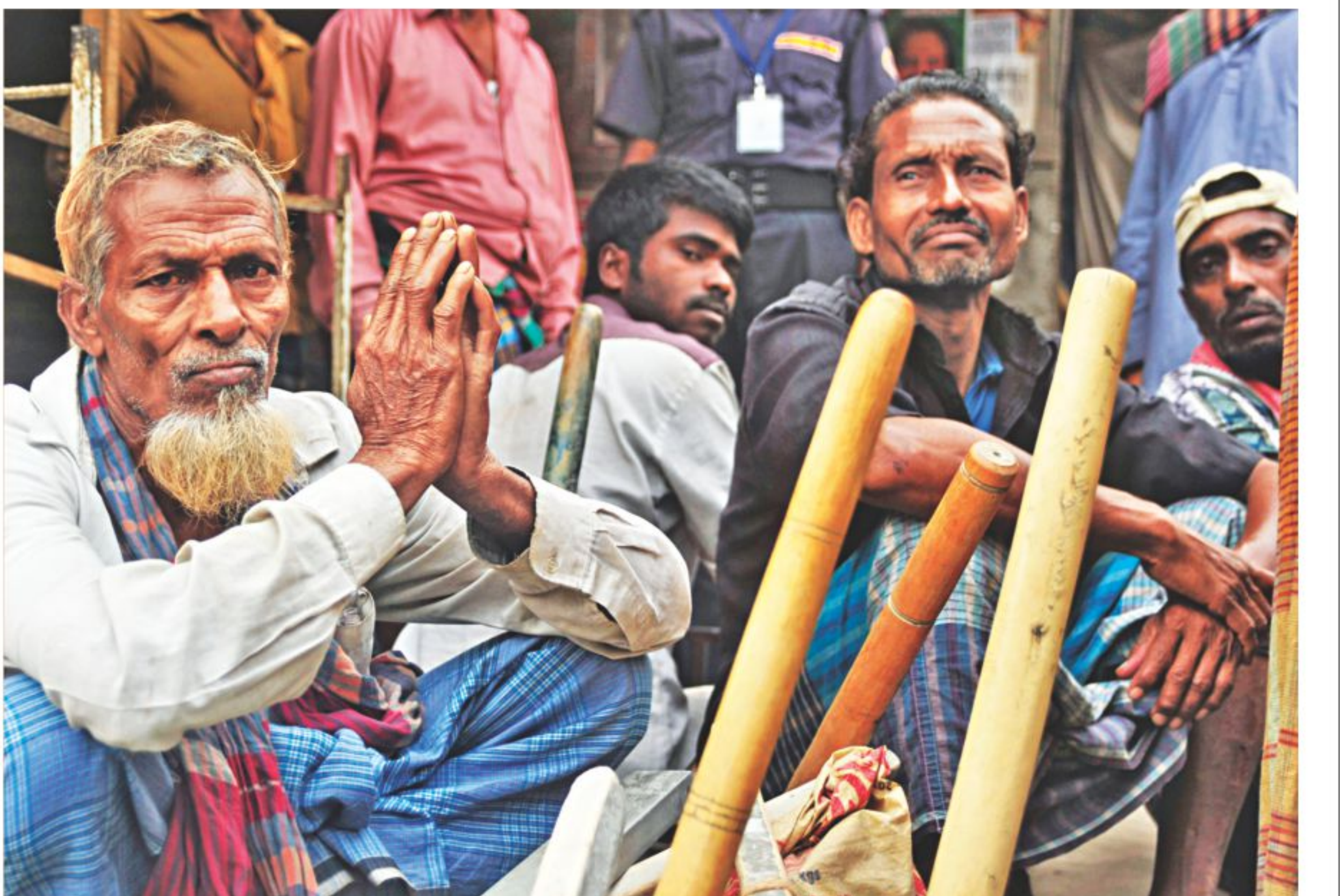
Day labourers wait forlornly for jobs at Alam Market near Bou Bazar in the capital. However, most of their wait is in vain as out of around 500 labourers that wait every day only about 60 manage to get work. The photo was taken recently.