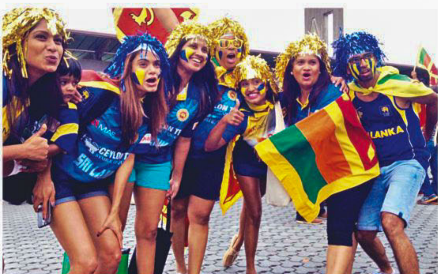
Some Sri Lankans celebrate before the Lions played Australia yesterday. A little Kiwi was all geared up for New Zealand's game against the robust Afghans.