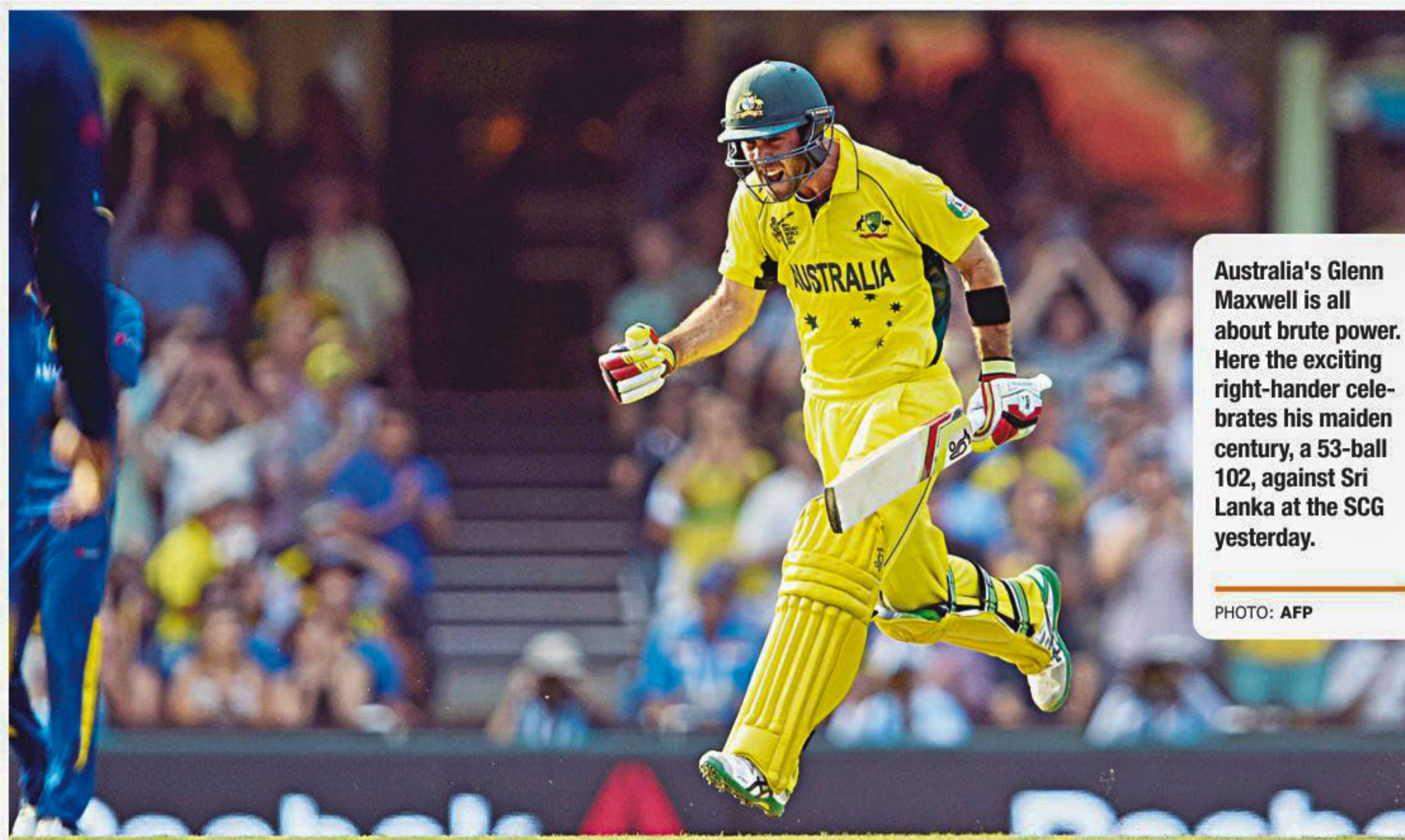
Australia's Glenn Maxwell is all about brute power. Here the exciting right-hander celebrates his maiden century, a 53-ball 102, against Sri Lanka at the SCG yesterday.

As for the 37-year-old Sangakkara's latest century, Mathews added: "He's brilliant. He's ageing and he's getting better and better."