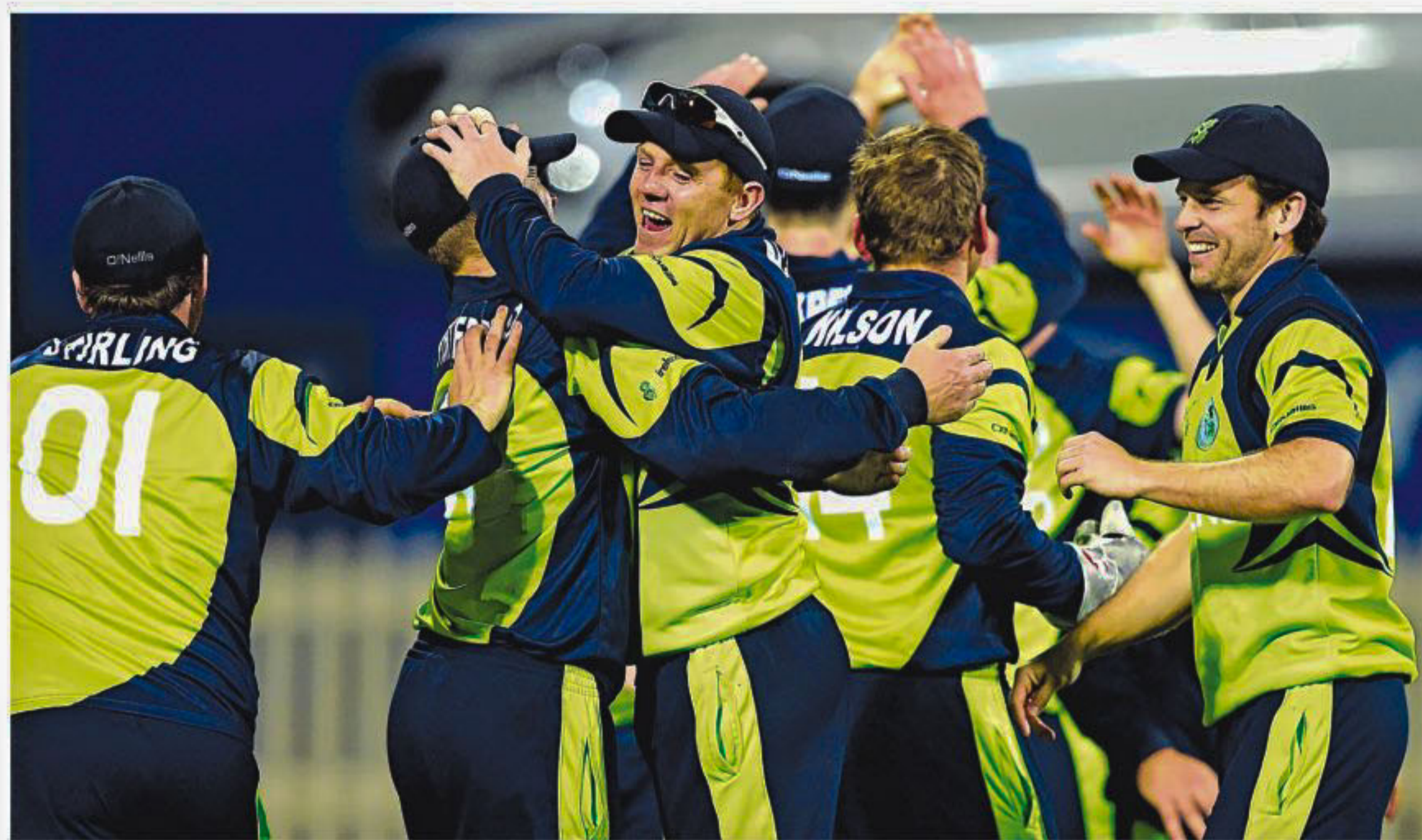
Ireland players are over the moon after their nail-biting five-run win against Zimbabwe at the Bellerive Oval in Hobart yesterday.

On social media, cricket fans slammed the ICC for this controversy. Some of the African side's supporters felt Zimbabwe were "cheated".