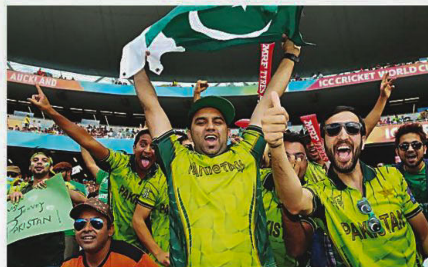
Pakistan fans celebrated their win against South Africa, but most of them were sitting on the edge of their seats for most of the game, like Imran Khan was. The Irish were in high spirits and were rewarded.