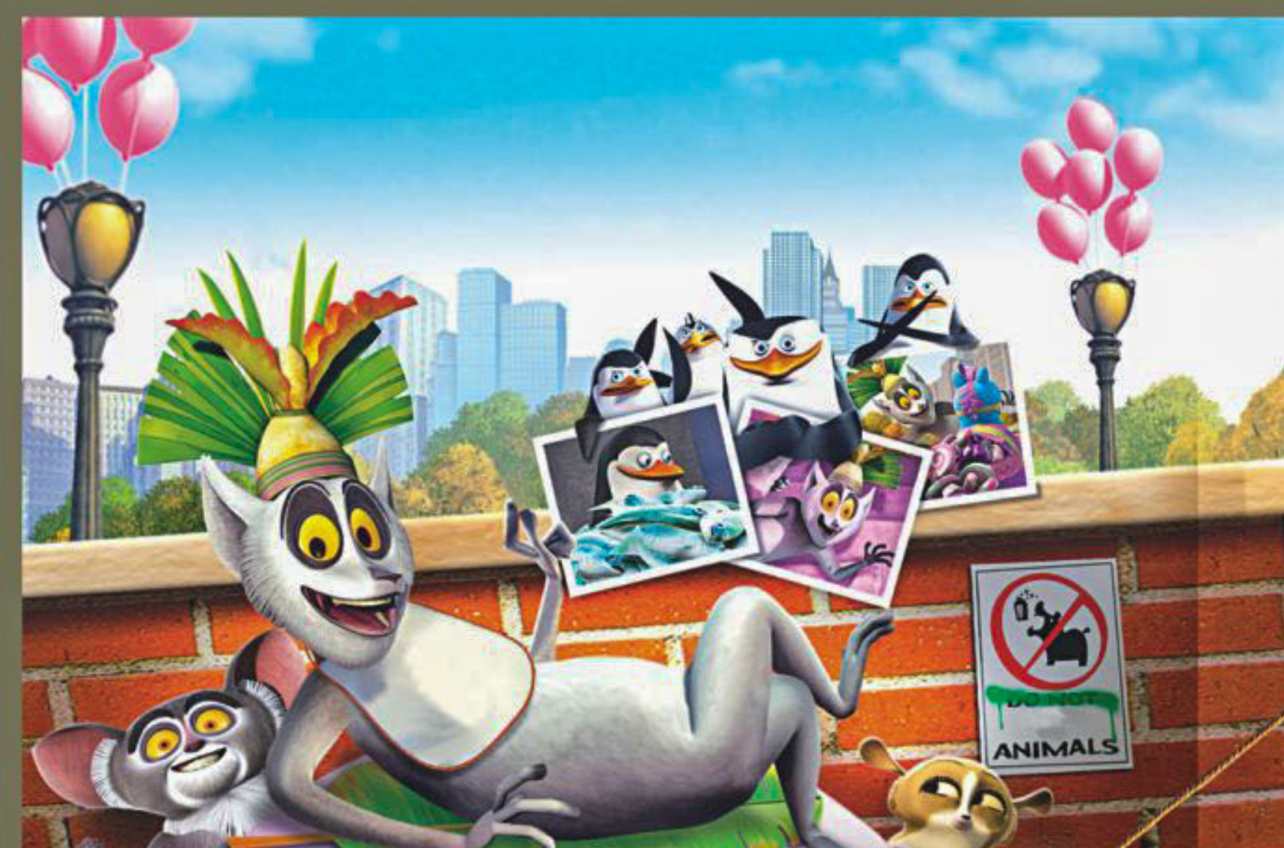
FIND FIVE DIFFERENCES BETWEEN THE TWO PICTURES FROM "P.O.M"

Send "ALL FOUR" answers to showbiz.tds@gmail.com Winners will receive QUEEN SPA ROOM GIFT VOUCHER courtesy of Queen Bella ALL 4 QUESTIONS MUST BE ANSWERED CORRECTLY