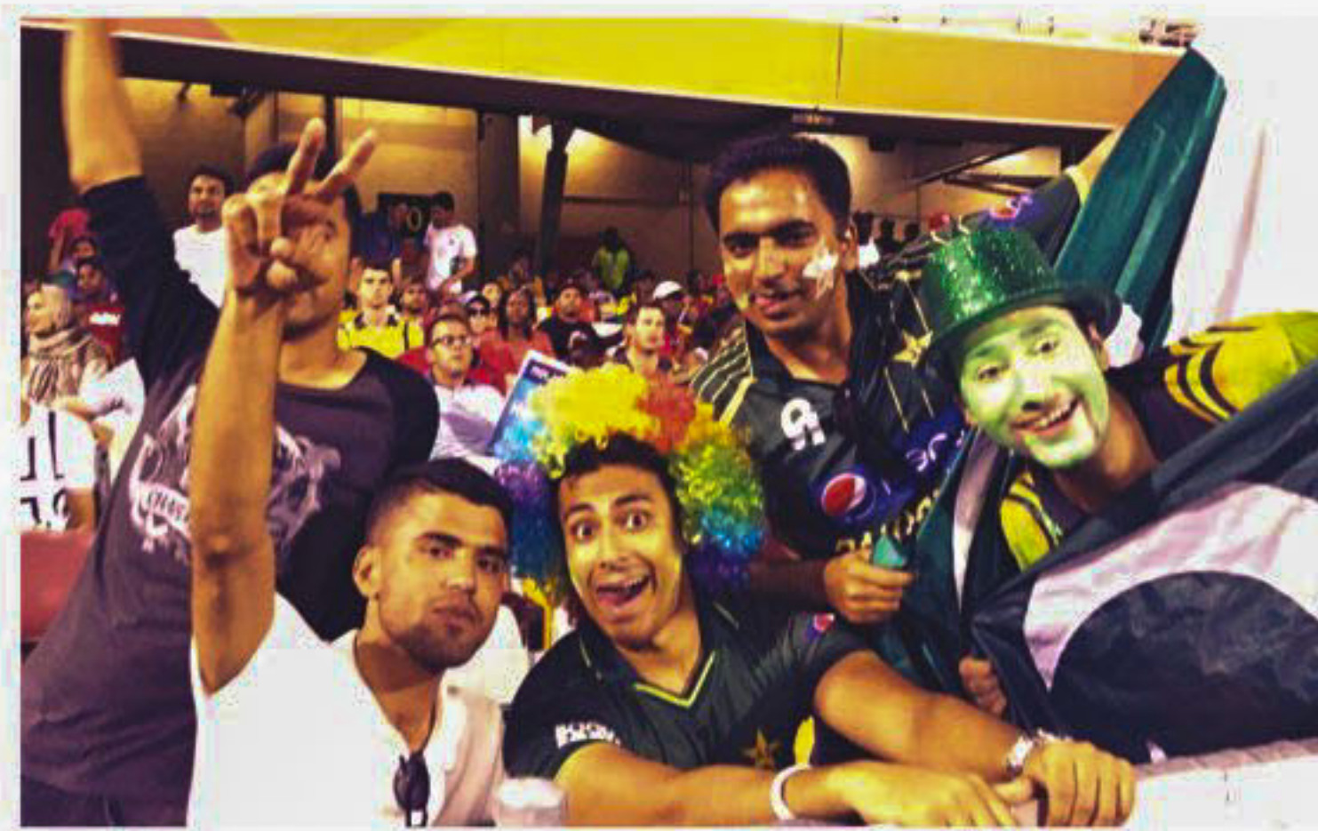
Pakistan and South African fans will both be cheering for a crucial win today. (Top-right) An India fan shows his India-themed contact lens during the India v West Indies game yesterday.