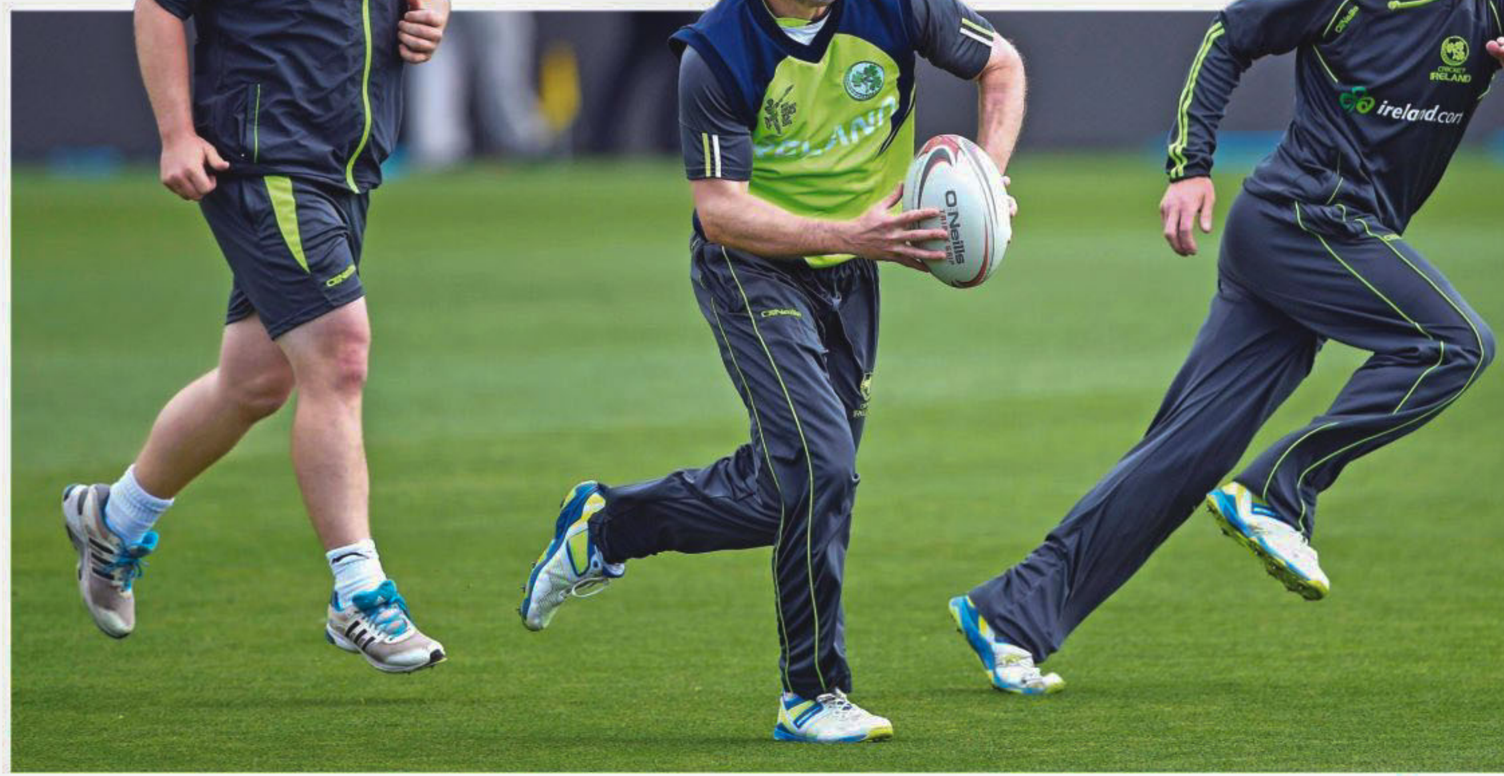
Ireland captain William Porterfield (R) and his teammates indulge in a game of Gaelic Football during training at the Bellerive Oval yesterday, ahead of today's game against Zimbabwe today.