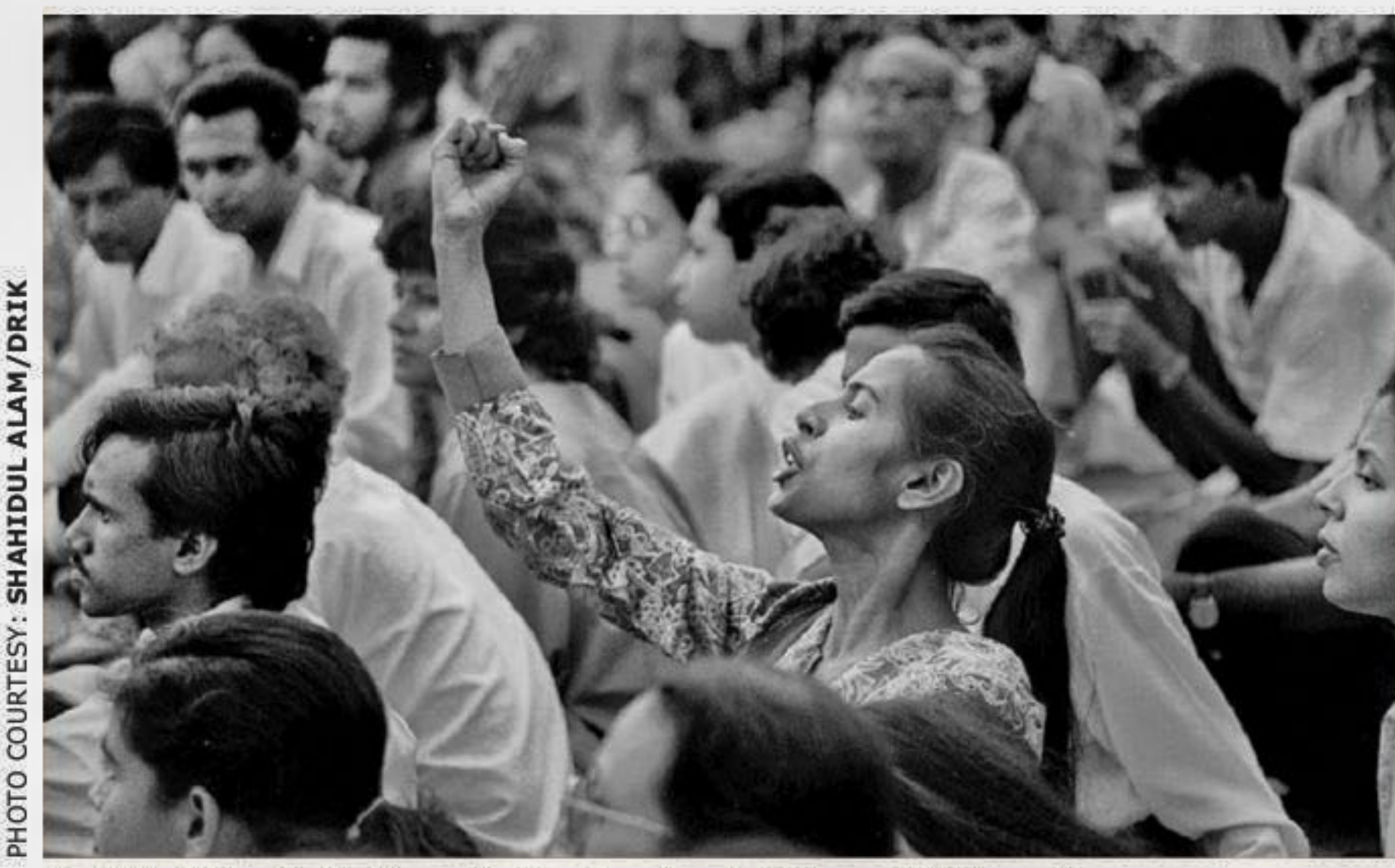
Shahidul Alam's "A Struggle For Freedom" at the exhibit has strong socio-political images.