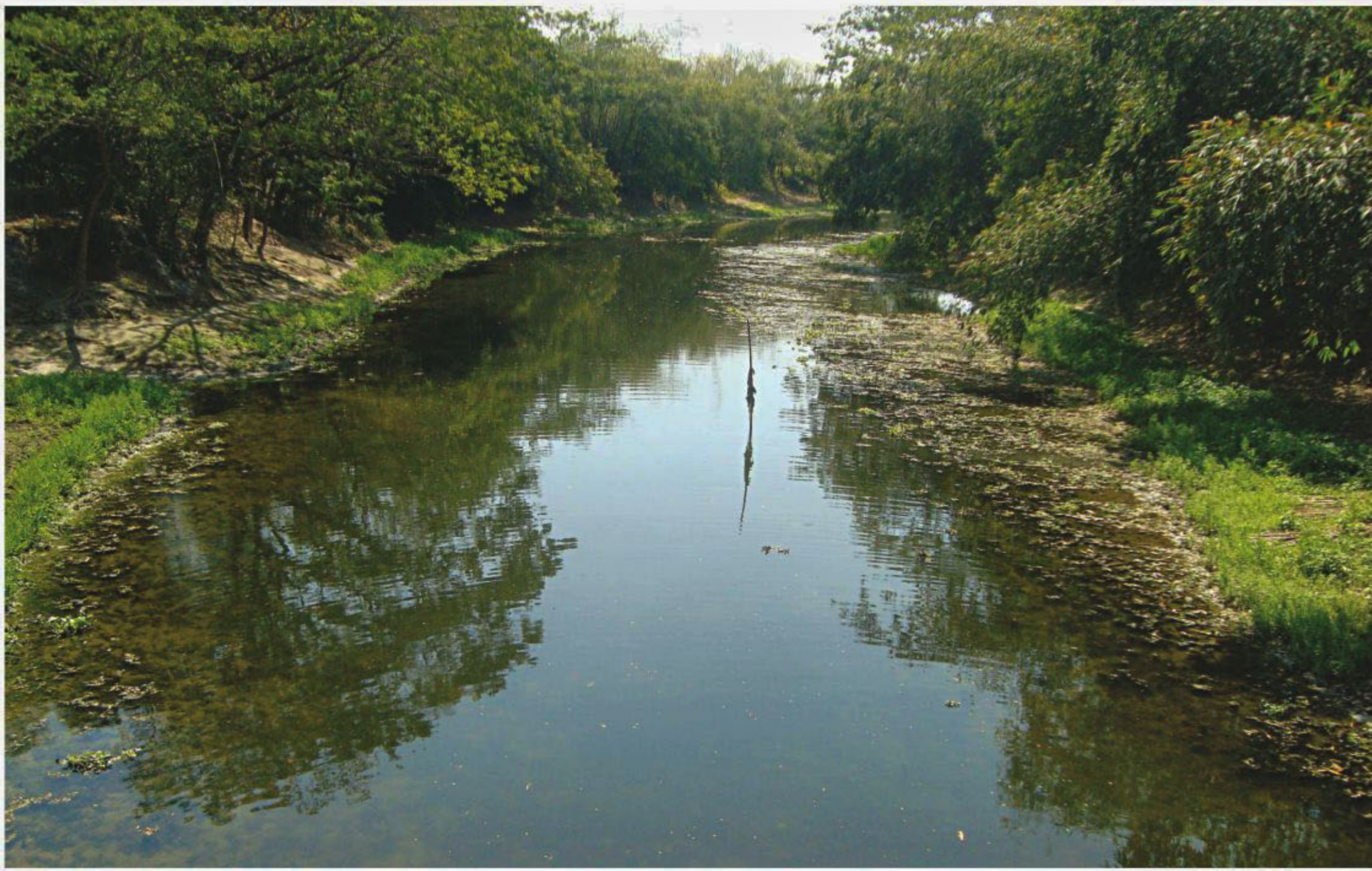
Only 25-30 years ago, the Begbota River flowing through Jhenidah sadar upazila was used as a sailing route for commercial boats. But due to a lack of water and conservation efforts like dredging, the river is now in the throes of death. Instead of being a source of fresh water, it has become a poisonous reservoir that cannot sustain aquatic life including fish anymore. The photo was taken near Naldanga Bazar on Thursday.