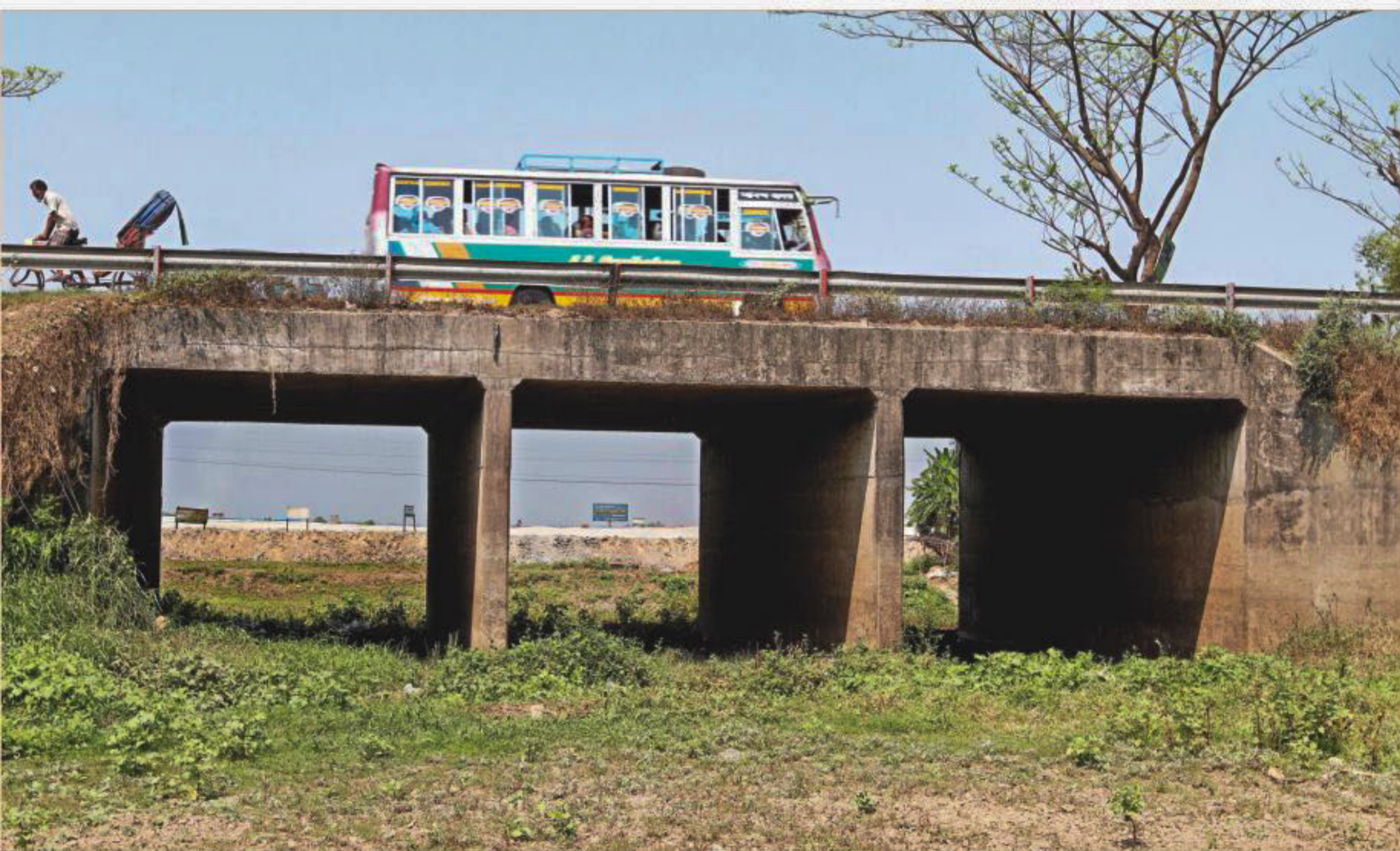
This culvert has virtually lost its use because of rapid land development on both sides replacing vast wetlands along the Dhaka-Mawa Highway, just outside the capital. The photo was taken yesterday in Keain of Munshiganj that testifies to how unplanned urbanisation is wiping out the swamps, which are an integral part to maintain the environmental balance.

On their information, Rab found another 28,000 Yaba pills in Shulakbahar.