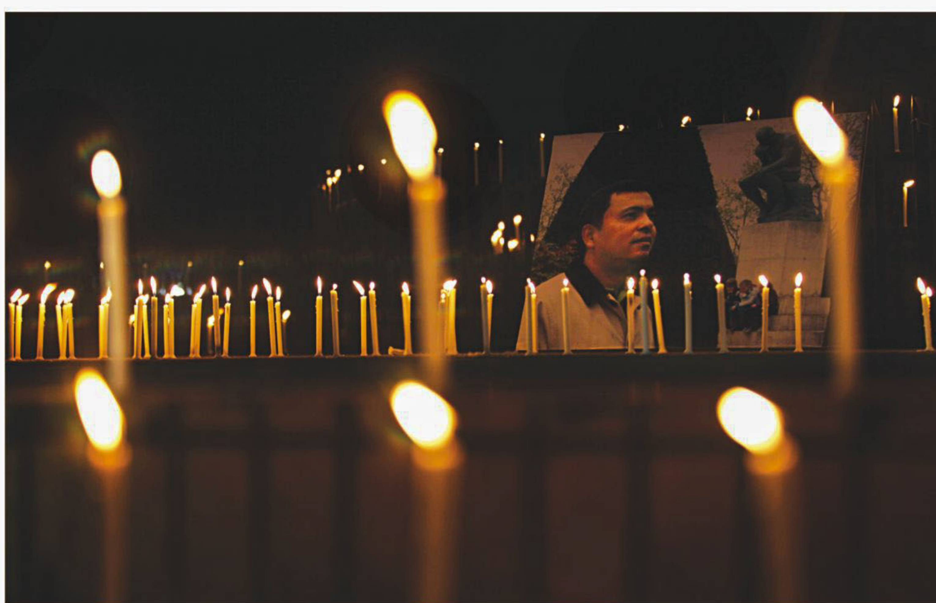
People hold a candlelit vigil near Raju Bhashkarja on Dhaka University campus yesterday evening protesting the murder of writer Avijit Roy. On February 26, Avijit was hacked to death and his wife seriously injured in an attack only yards away from Raju Bhashkarja.