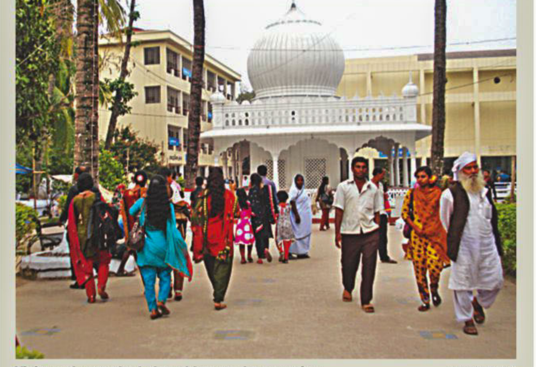
Visitors through the Lalon akhra on the occasion.

The five-day Lalon Smaran Utsab (Lalon memorial festival) at the Lalon Akhra, began at Chheuria in Kushtia, yesterday. The annual festival, also called Dol Purnima Utsab, has been organised by the Lalon Academy that oversees the upkeep of Lalon's shrine. The akhra saw an influx of Lalon devotees and admirers from Bangladesh and overseas. As always the big attraction of the event, organised through donations from Lalon's exponents, is a Baul Mela and rendition of baul songs. Apparently, Lalon used to organise the event himself at his akhra. After his demise, his shishyas (disciples) carried on with the tradition. The programme aims to highlight the philosophy of Lalon that he introduced around 200 years ago. After the death of the bard, the celebration is held in memory of the saint. Lalon's philosophy lies in his songs he wrote. These songs fuse two streams of spiritual thought -- Sufism and Vaishnav (the Krishna cult). Among others, Information Minister Hasanul Haq Inu, several lawmakers and senior government officials are slated to address the gathering.