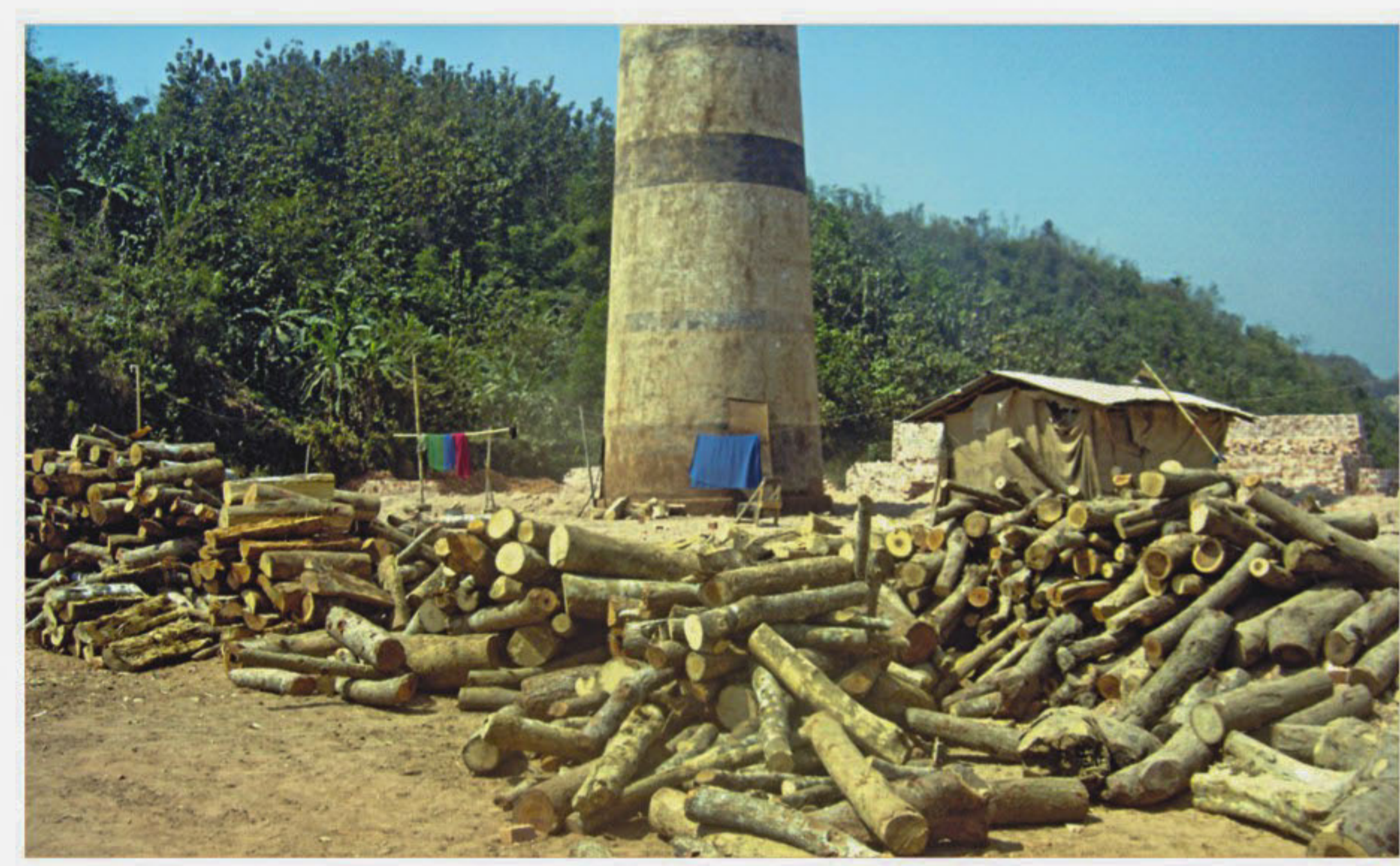
Violating environmental laws, brick kilns in Bandarban have been using firewood to burn bricks leading to deforestation in the area. The photo was taken at BBC Brick Kiln yesterday.