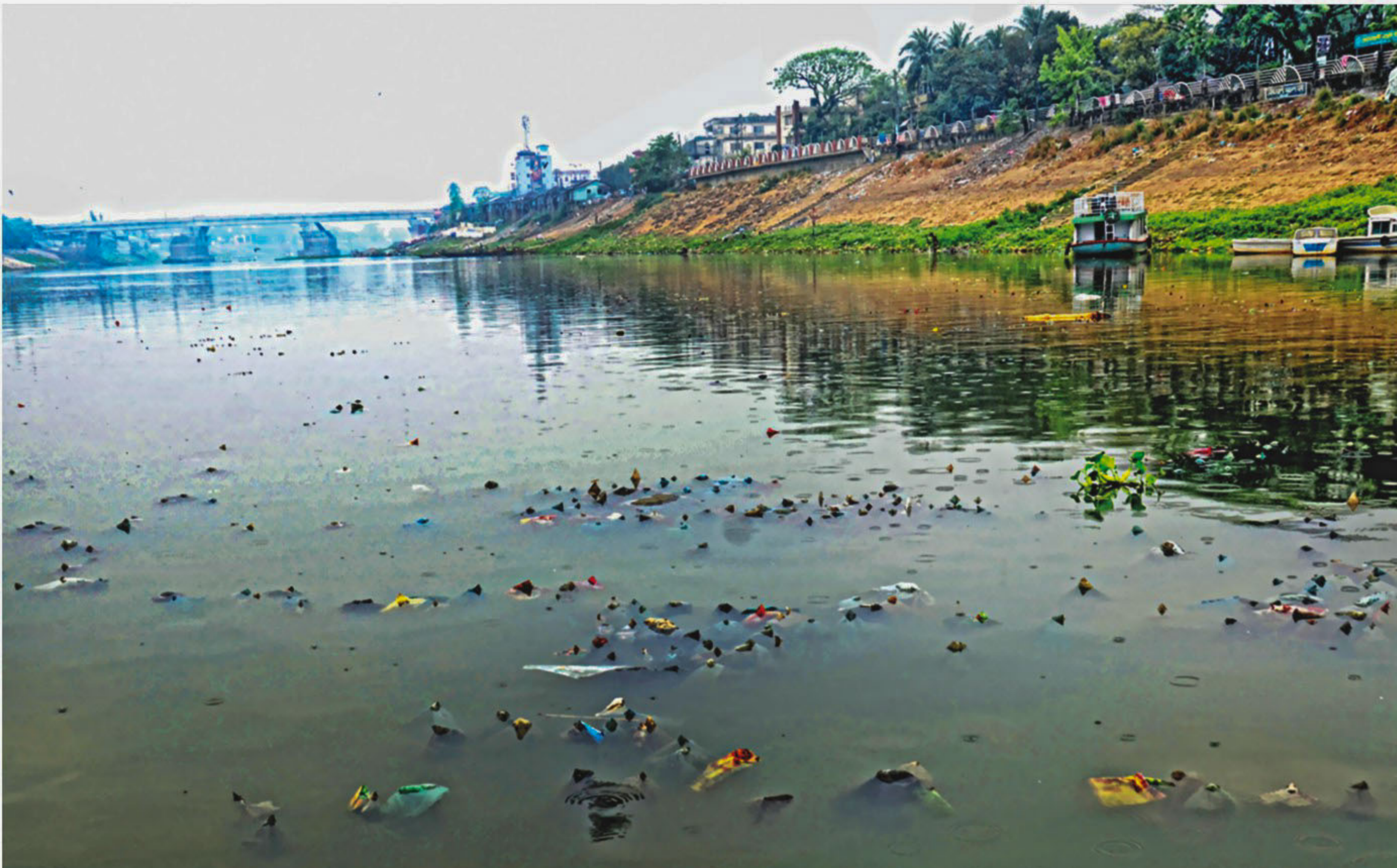
People dump rubbish into the river Surma polluting its water. The photo was taken in Keane Bridge area in Sylhet city yesterday.

BSS, Dhaka The parliamentary standing committee on Chittagong Hill Tracts (CHT) affairs ministry yesterday suggested the ministry to increase communication with the power ministry for further expansion of electrification in the CHT. At its 9th meeting in Jatiya Sangsad Bhaban the committee also recommended fixing fund allocation rate for development activities and giving appointments to the vacant 1st and 2nd grade posts in three hill districts. State Minister for the ministry Bir Bahadur Ushwe Sing M, the committee chairman and its members attended the meeting. Meanwhile, the parliamentary standing committee on fisheries and animal resources ministry at its 7th meeting recommended procuring new animals for the Dhaka Zoo and securing its land with barbed wires. It also recommended involving foreign agencies, SEE PAGE 5 COL 2