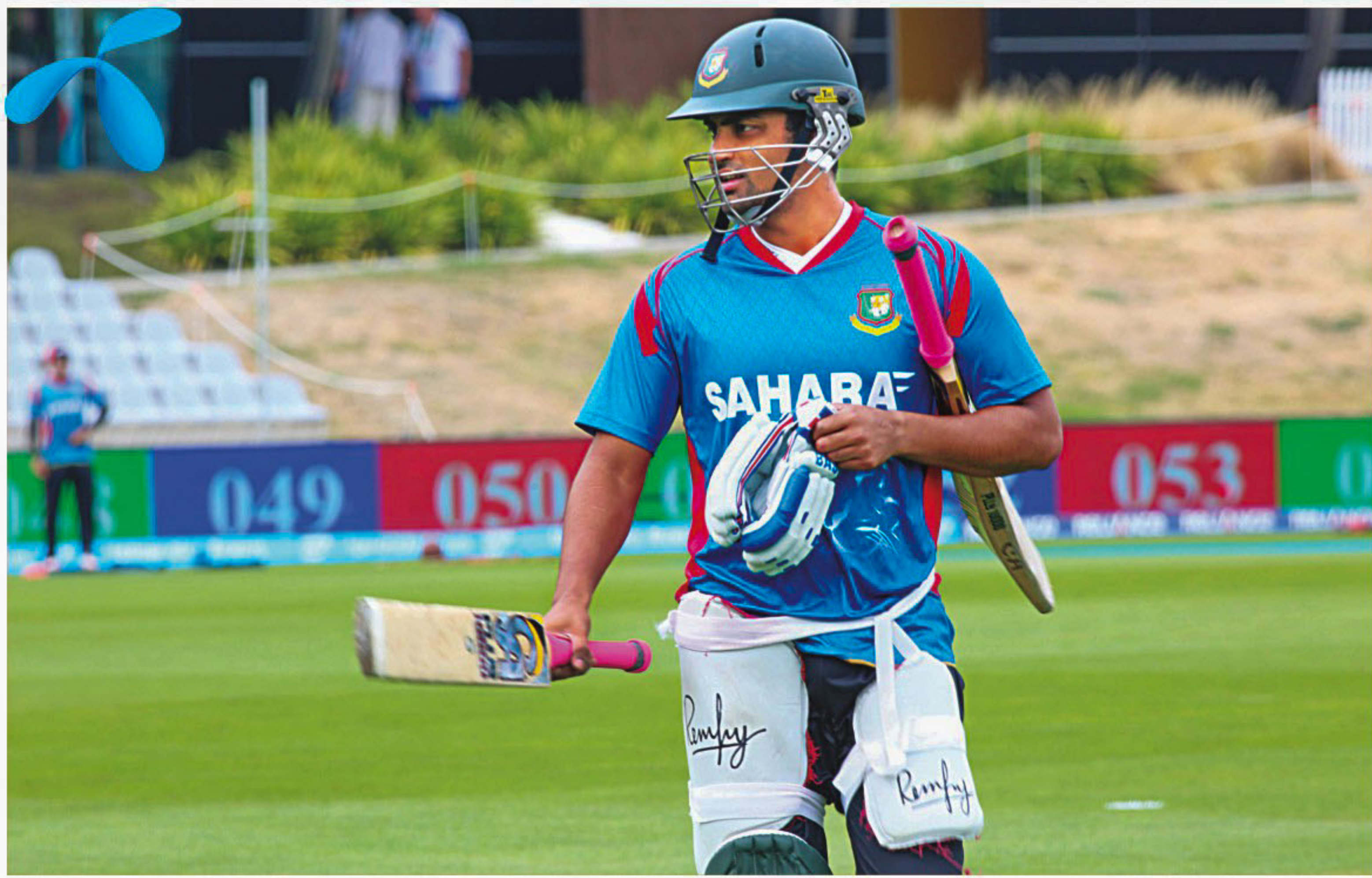
It's about time for Tamim Iqbal to come out of his rusty self and show the world what he is capable of with his trusted bat.