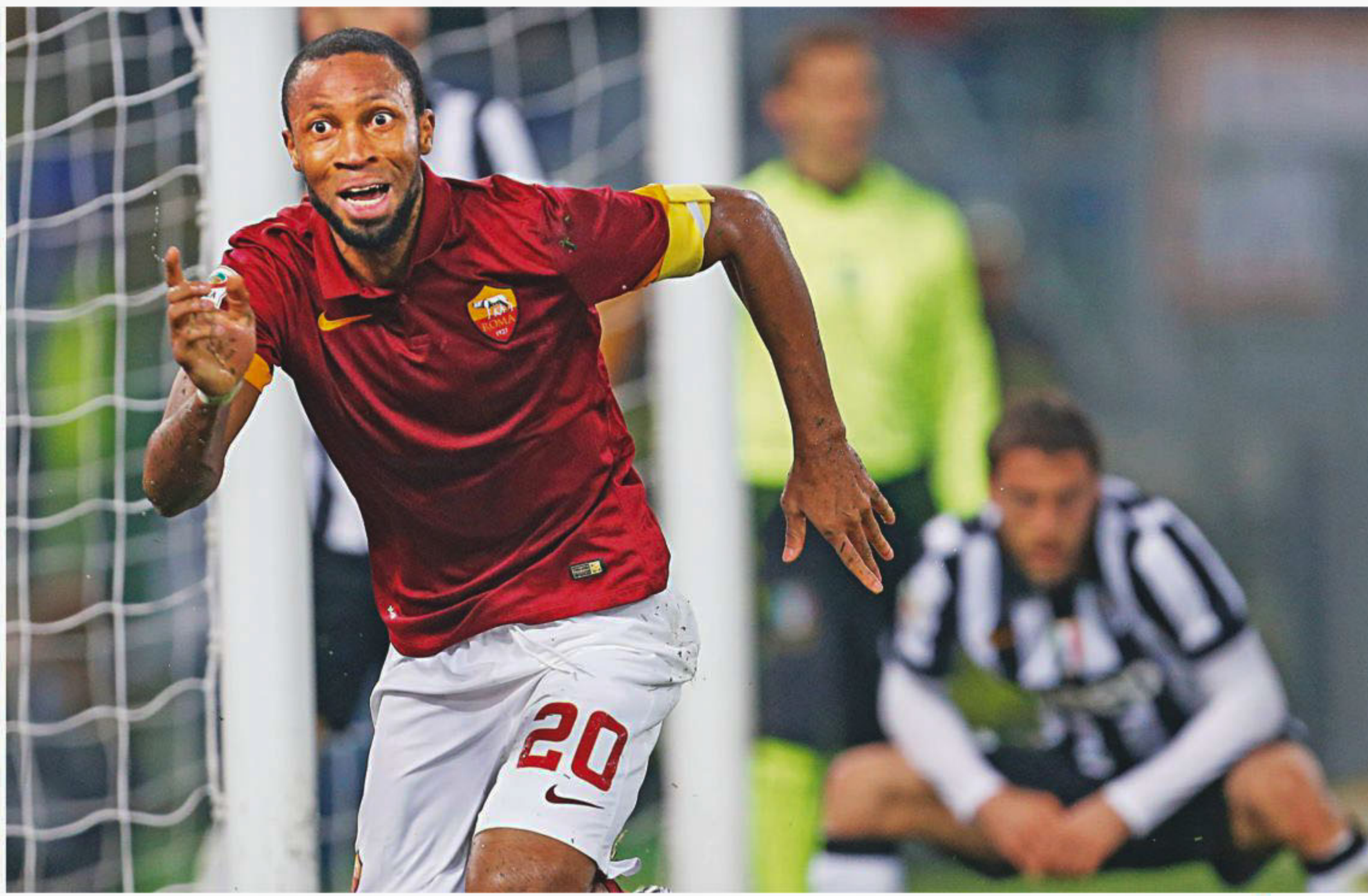
Roma midfielder Seydou Keita goes off on a celebratory run after scoring the equaliser against Juventus during their Serie A encounter at the Olympic Stadium in Rome on Monday.

"I don't think he suffers from that, looking at him in training. Certainly, you lose a bit of confidence in your body."