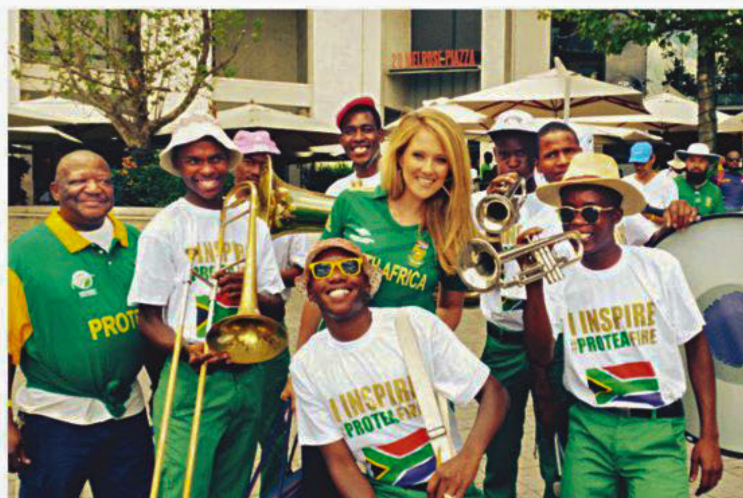
South African fans celebrate their victory while the Irish enjoy their time at the Manuka Oval yesterday.