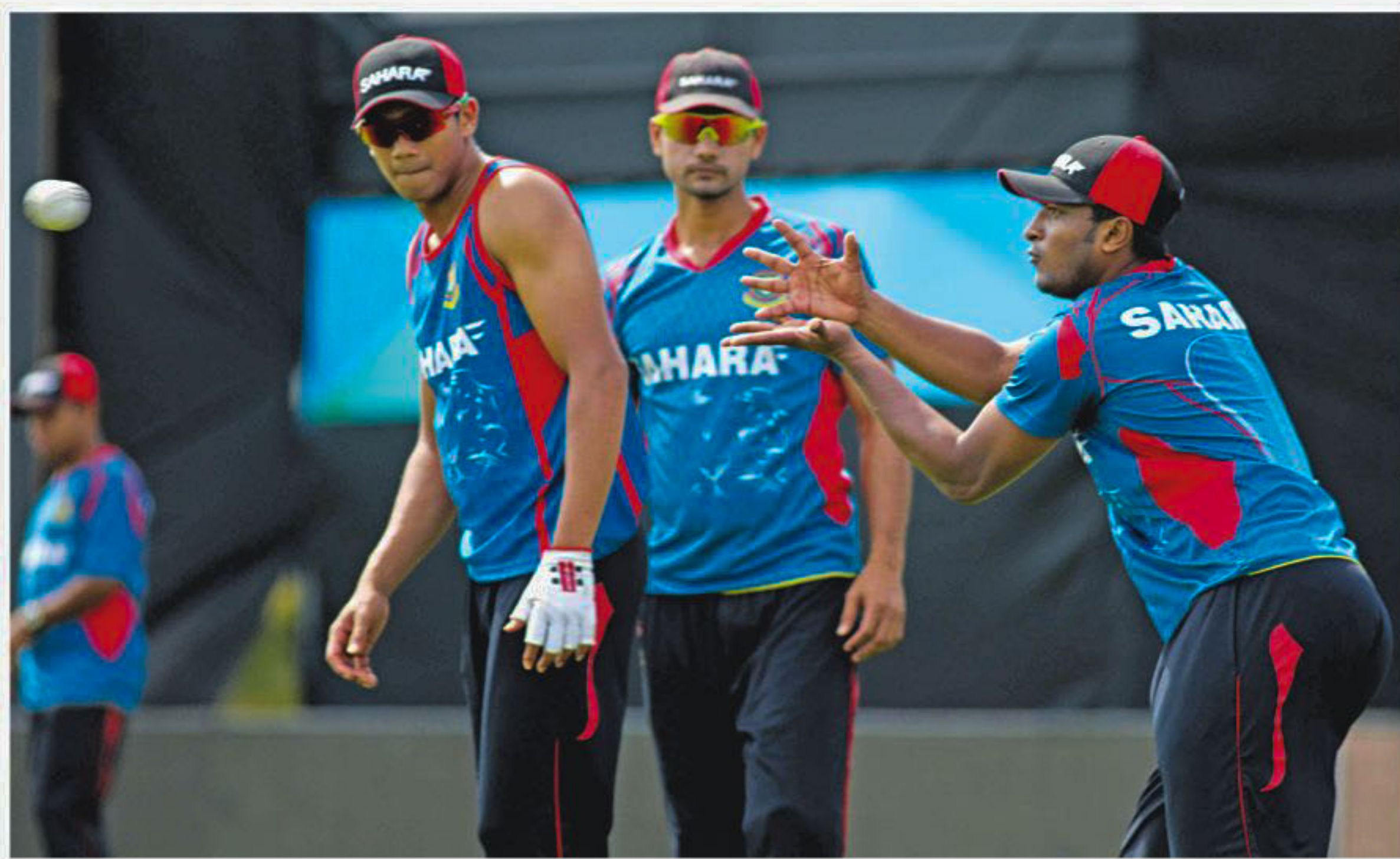
Shakib Al Hasan (R) needs to excel both with the bat and ball against Scotland to reclaim his status as the world's top ODI all-rounder.