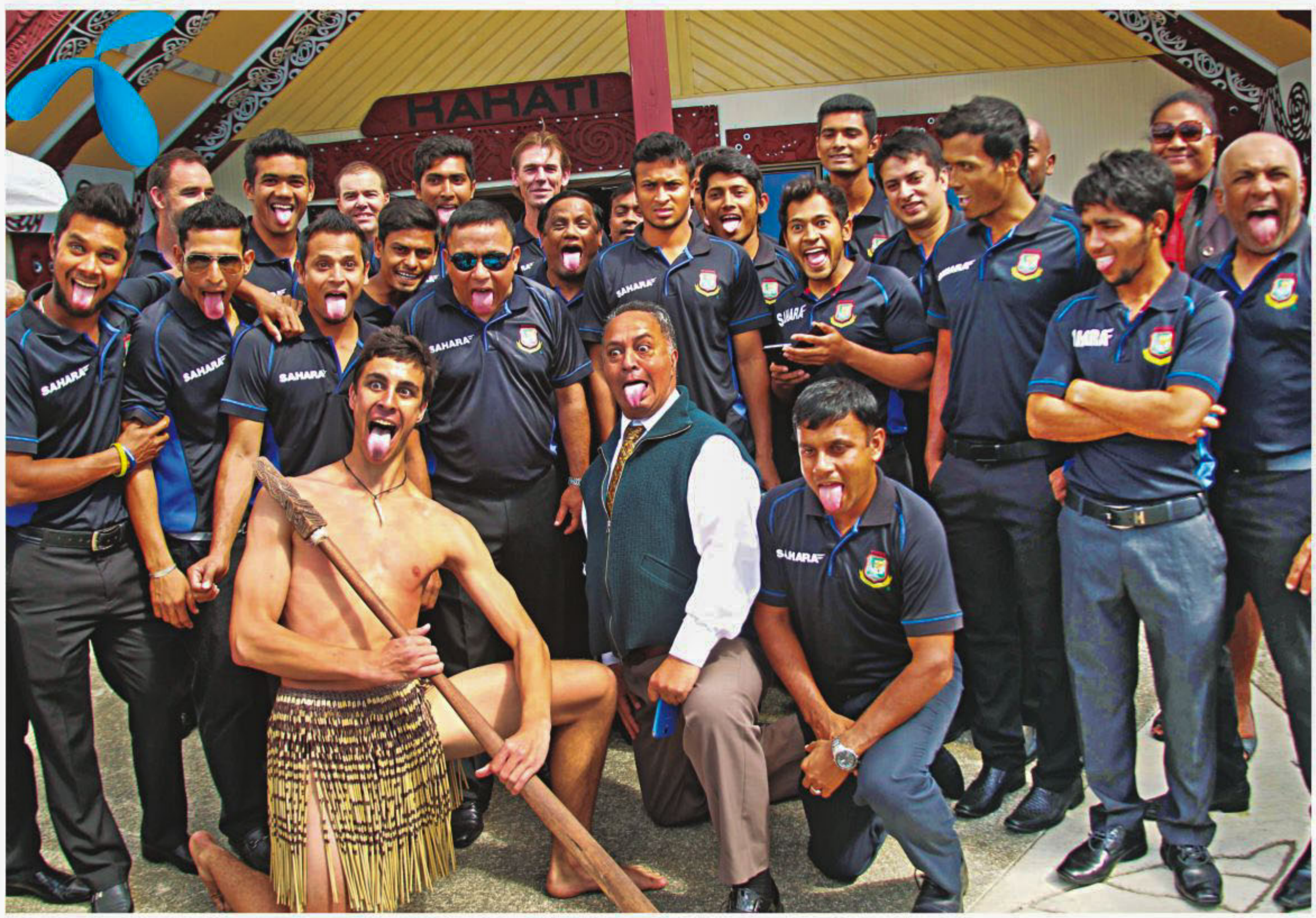
The Bangladesh cricket team seems to have got the hang of the haka dance, a ritual of the Maori tribe of New Zealand, during a reception organised by the Nelson City Council yesterday. The Tigers will need to evoke similar warlike spirit when they take on Scotland in a must-win game at the Saxton Oval on Thursday.