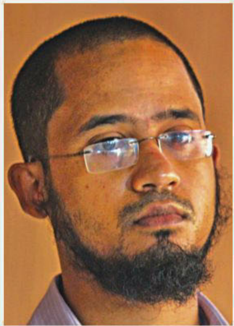
death in Mirpur on February 15 the same year.