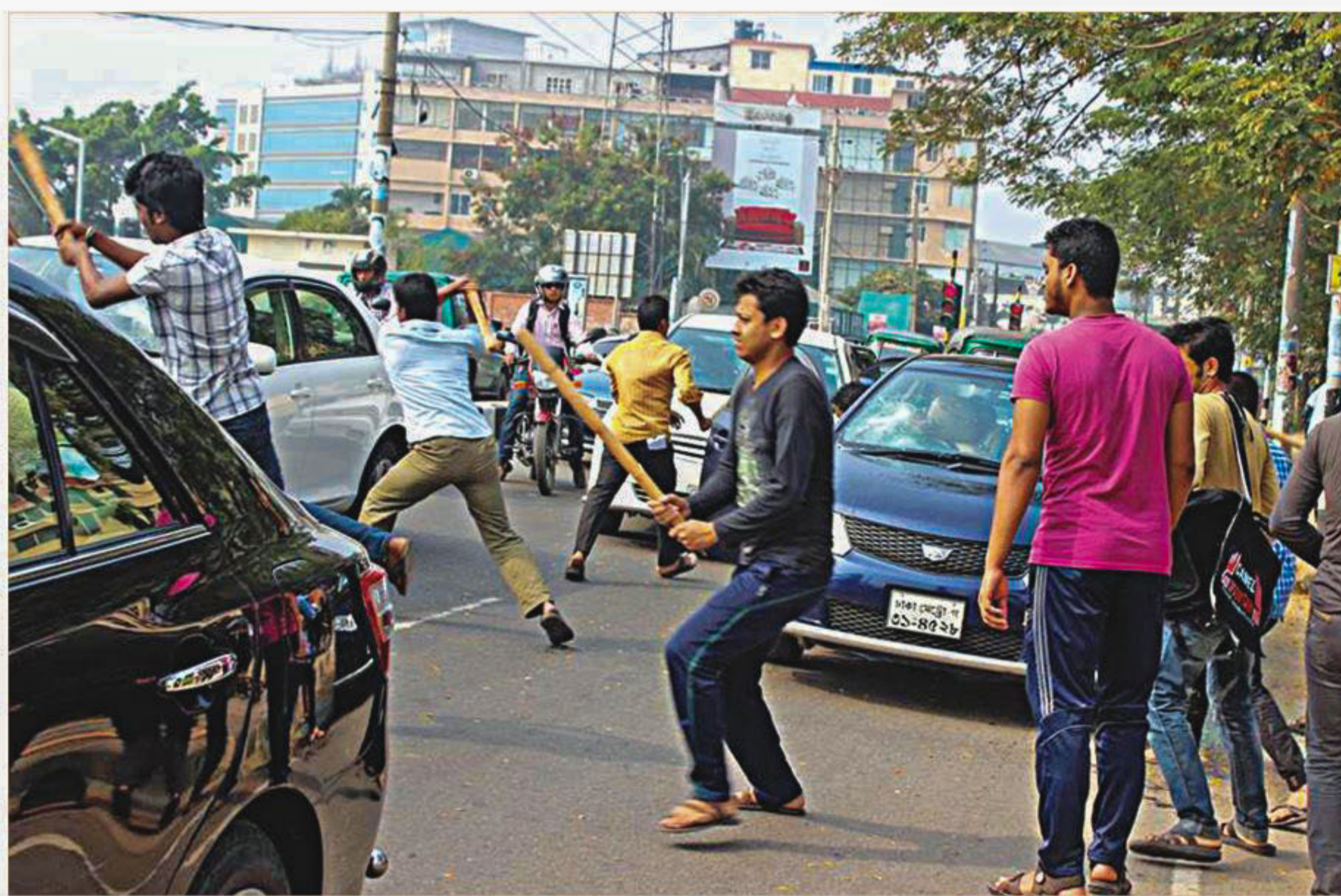
Suspected pickets vandalise and torch cars in Hatirjheel area of the capital yesterday morning during the opposition's 72-hour hartal.